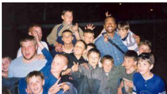
Missionaries from the Franciscan University of Steubenville ministering to kids in Vladivostok