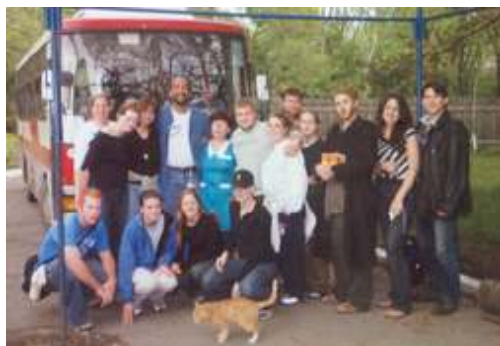
Steubenville Team, 2004