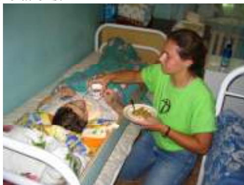
Caring for Hospice patient

While experiencing the thrill of serving in a foreign country the greatest contribution you will offer as a missionary volunteer is the living example of our Faith. As you work, pray, and play together you bring Christ to the people of Russia, a country spiritually devastated from atheistic Communism for over three generations!