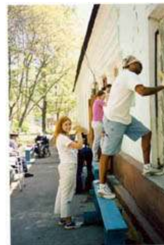
Missionaries painting windows at the hospice building.

As a missionary to Vladivostok you will have the chance to see how the average Russian lives, visit with parishioners and even visit many of the historical sites. Most of all you will be sharing your