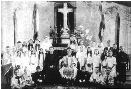
First Communion class, 1922, Most Holy Mother of God Cathedral in Vladivostok, shortly before the church building was confiscated.

For most of the 20 th century, the cold, iron fist of communism ruled Russia, nearly obliterating all religion. Hundreds of thousands of priests and religious were killed. Churches were confiscated, desecrated, or dynamited.