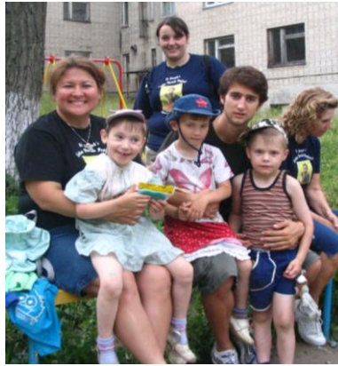
Mission team visitors play with children at an orphanage in Vladivostok.