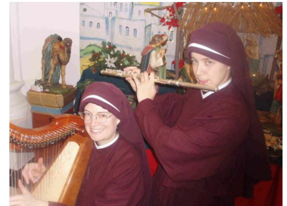
Sisters in Jesus the Lord provide music for liturgical services. They also bring music and song to the elderly confined to the local hospice

The Russian people are always amazed to hear the story of Our Lady of Fatima. They find it incredible that we prayed for them and for the conversion of Russia during those dark years of persecution. Today, they are grateful that people are reaching out to help them build churches and bring the light of Faith. In return, they pray for all their benefactors.