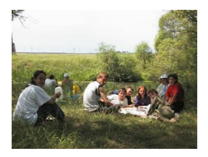
Lunchtime break in the shade of a handy tree.