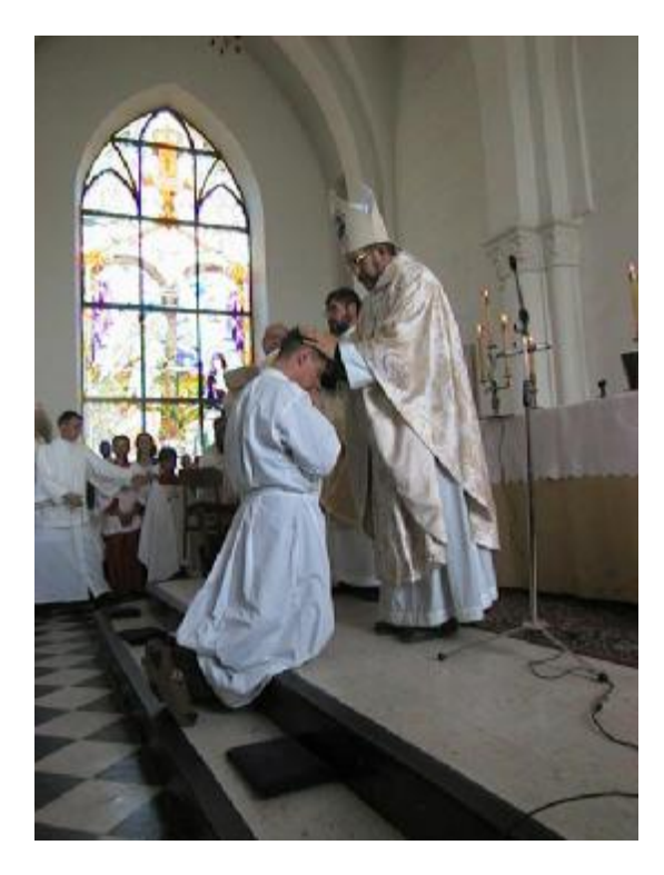
The ordination moment—Laying on of hands.

preparations for the dedication of the new cathedral in Irkutsk which is scheduled for September 8.