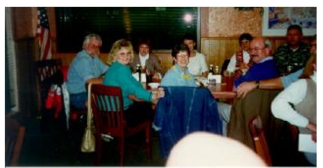
Sister parish Committee