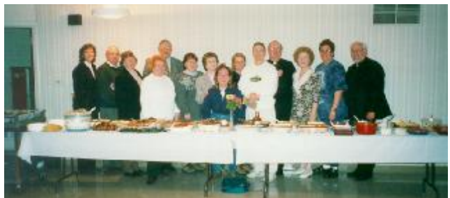
Sister Parish Committee in the limelight.