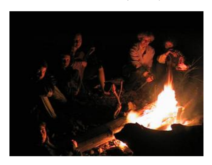
Day ended with time for the rosary and fellowship around the fire.