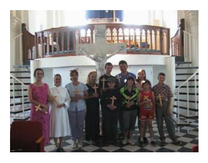
Home at last with Pilgrim's Cross in hand.