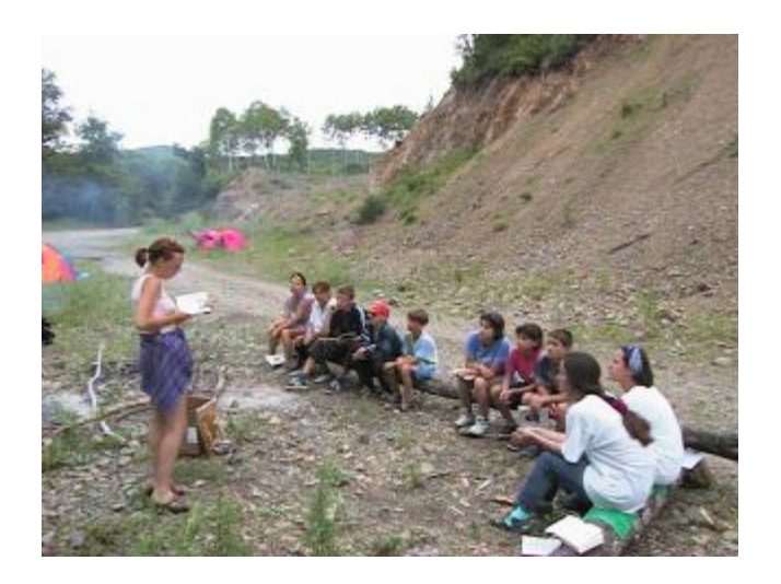
The day always began with prayer, with a "spiritual theme of the day"—one of the titles of Jesus.