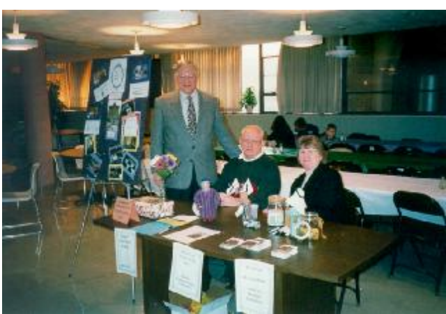
Raffling off the Russian Christmas dolls.