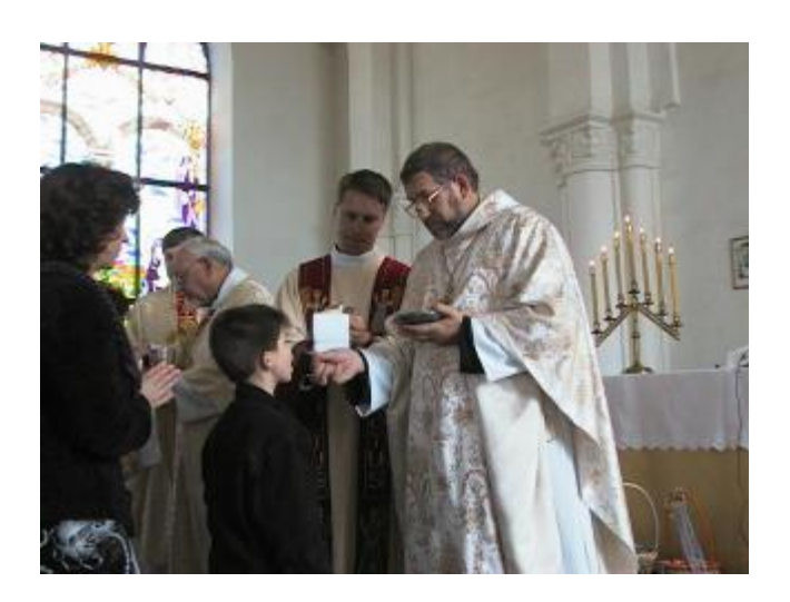
Helping the Bishop with Communion

June 25 was "Corpus Christi" in Vladivostok. Here the new deacon is helping with the procession on the street.