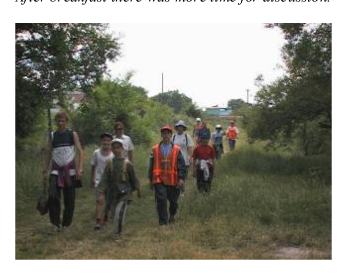
Then the long trek began.