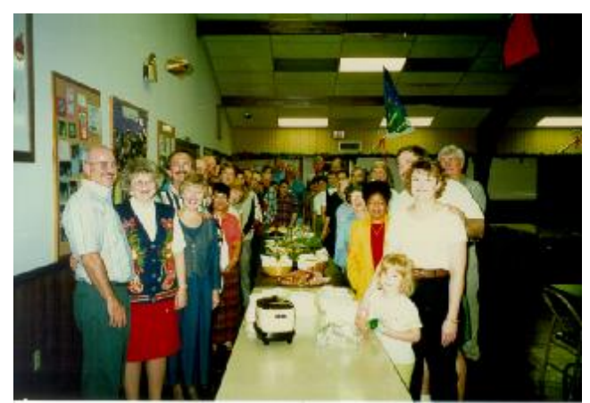
Hungry and waiting for the promised spaghetti dinner.