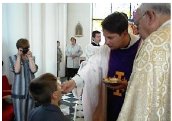
First Communion from newly consecrated hands.