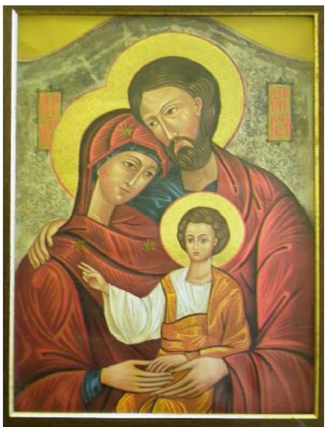
Icon of the Holy Family for the Year of the Family.