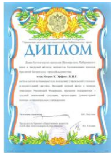
From the Department of Corrections. See Page 3.