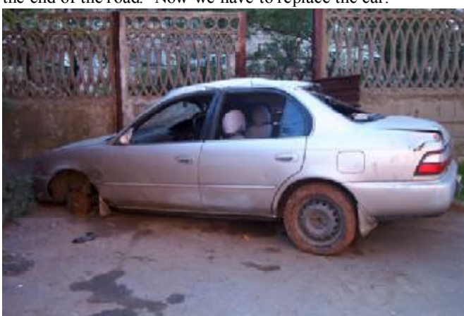
Our wrecked car. Most valuable parts were stolen from it while it was in police impoundment, including the radio/audio system. It is a total loss.

• As was reported in the last Sunrise , one of our cars was totaled on the road to Arsenyev. Finally we were able to recover the car after the police finished with the investigation. The driver was found not guilty of any wrongdoing, and the conclusion was that it was a freak accident involving gravel at the end of the road. Now we have to replace the car.