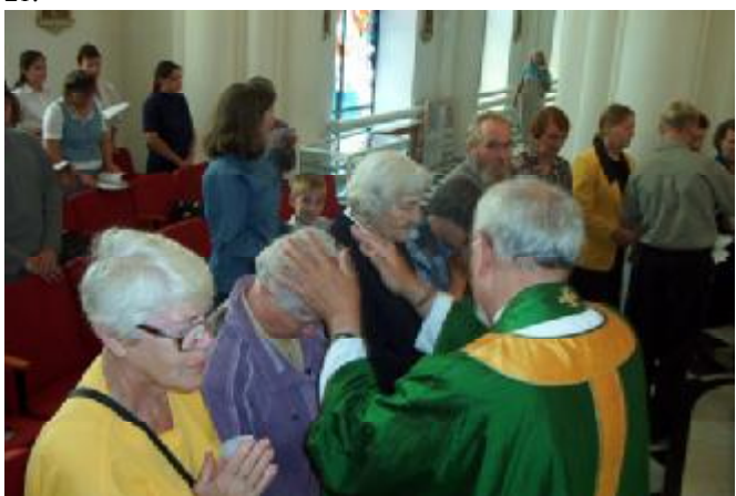
Laying on of hands with prayer before anointing.

One of my favorite liturgical events of the year is the anointing of the elderly and sick of our parish which took place this year on September 29. Winter can be hard for our elderly who usually don't have cars, telephones, and often live in tall apartment buildings without elevators. Even if they can get to public transportation, they still face the daunting task of either climbing the slippery slopes up to our church building from the main street of Vladivostok which is called "Svetlanskaya", or they can risk the steep, icy dirt road which comes down to the church from the new "Beauty Avenue". Parts of the city never have the snowed plowed all winter. Many of the elderly simply can't get to the church in the wintertime. The anointing takes on even greater meaning for them. This year the first snow was on October 21.