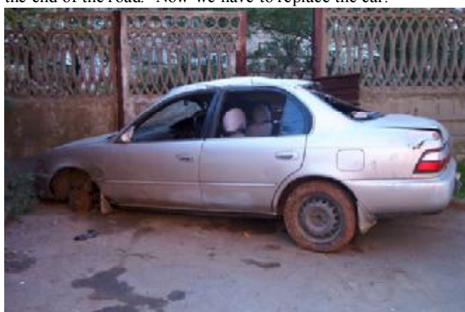
Our wrecked car. Most valuable parts were stolen from it while it was in police impoundment, including the radio/audio system. It is a total loss.

• As was reported in the last Sunrise , one of our cars was totaled on the road to Arsenyev. Finally we were able to recover the car after the police finished with the investigation. The driver was found not guilty of any wrongdoing, and the conclusion was that it was a freak accident involving gravel at the end of the road. Now we have to replace the car.