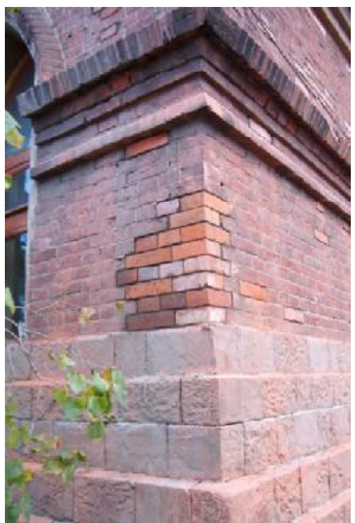
After work on the bad corner. The whole wall has still to be worked over for uniform color.

injured during these dangerous repairs. Once the façade is finished we will still have two giant steps to finish the repairs of the cathedral: To build the steeples, and to remove the extra story that was added inside, when the Communist government converted the building to an archive.