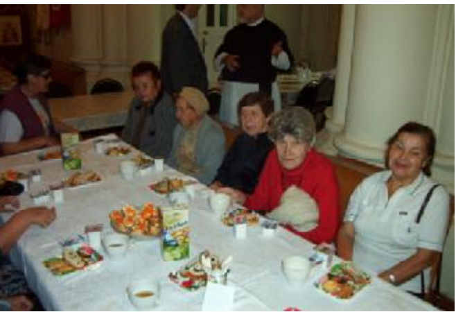
There is a treat and tea for the elderly after the mass.

A few minutes of personal talk with the pastor.