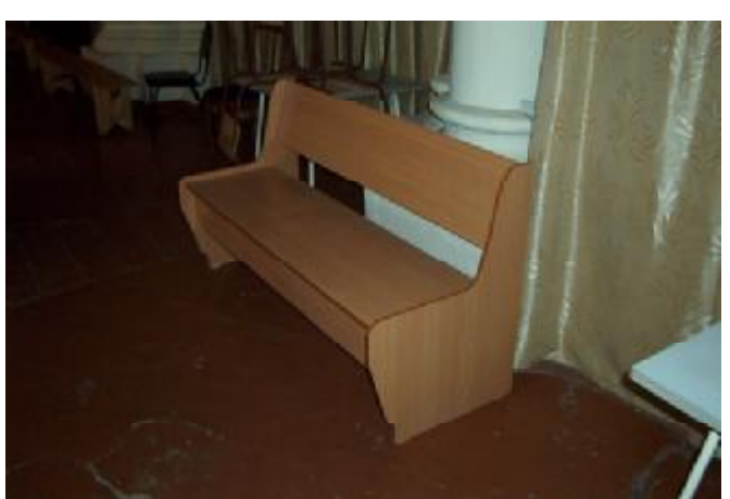
First sample pew for Lesozovodsk from our factory. We decided to use these usual Russian kitchen benches as a model--with kneelers added. They were produced by the wood factory of FOMIP, our charitable organization modeled on the St Vincent de Paul Society.

chapel, which also has attached simple overnighting quarters for a priest, a room for charitable activities for CARITAS, and space for catechism classes. A big sign outside the outer door of the building welcomes everyone. There is a piece of land not far away which we look at occasionally, thinking about the time when the parish might have its own church building. The present chapel could be the priest's apartment in that future plan. The parish really needs a priest, of course, because it is far from Vladivostok, and the parish territory includes a third of the State of Primorye. There are many young families with children which live in very small one-room apartments in the building near the parish. It would be a paradise for a missioner who would want to work with children.