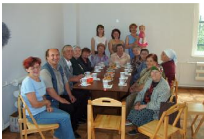
Parishioners had tea after the first mass in the new chapel a month earlier when it wasn't completely finished

"The Coronation of the Blessed Virgin Mary"—one of our new windows in the cathedral in Vladivostok.