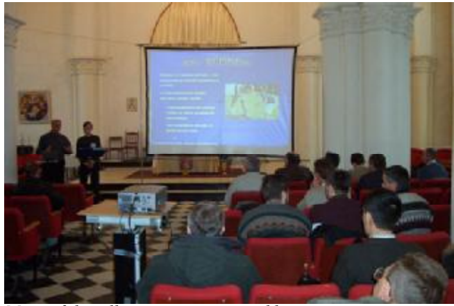
Many of the talks were accompanied by a powerpoint system.

4. The contents of the Conference sometimes weren't attuned to the Russian conditions (naturally), with many American problems like internet pornography; the statistics were American, and there was much talk about the problems of the American family instead of the Russian one.