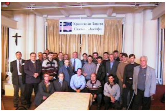
Group picture of those who attended all three days.

2. Long-term plans and projects must include the founding of a scouting group (initially for boys), work with men in prisons, and the founding of a center to help families, including marriage preparation, preparing mentoring couples. It would