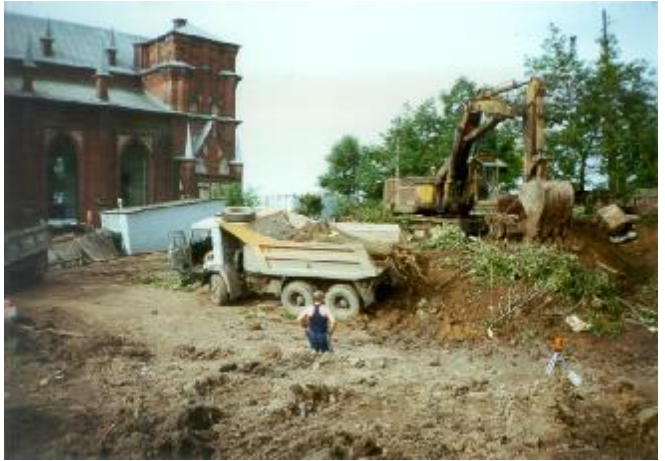
The construction site for the Our Lady of Fatima Rectory and Parish Center.

Ages ago in these pages I spoke about the need for capital for the church in Russia. Our neighbors to the far north in Magadan just "completed" their church, but are still suffering from lack of funding and most of the office space is not completed. Romanovka is hoping to solve its need for a church, working with its sister parish in Oregon. Nakhodka now barely has a chapel to call home after ten years, but still not a church. No parish in Nakhodka's sister-city of Oakland, California even answers our mail. Arsenyev has bought an inexpensive old wooden log cabin to call a church after eight years of its existence. The Blagoveschensk parish is still in its "temporary" chemical laboratory even though the Russian Orthodox Church has already completed its new cathedral there (with major help from Catholics) and none-the-less refuses to give the Catholics back their historical building for a decent church—the one that their ancestors built from private funds! In Khabarovsk the old wooden Catholic church has been condemned by the fire department, but the government refuses to give it back to the Catholics so that they can build their new church on the land. (Earlier they offered me a piece of land to build a church on for $1,000,000!) In Ussurysk the parish bought a small three room wooden building with help from South Korea. And in Vladivostok? We too are still waiting, hoping and praying that this will be the summer!