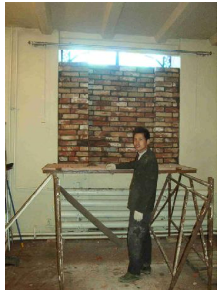
Our workers have come to us from all parts of China. They are certainly hard workers, fast and inventive. The Russian-Chinese translators are a couple who are professors of the Russian language in a university in China.