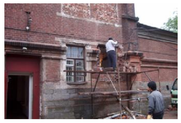
Windows being closed up in the future and past sanctuary of the church behind the former and future main altar.

The exterior walls are beautiful after restoration!