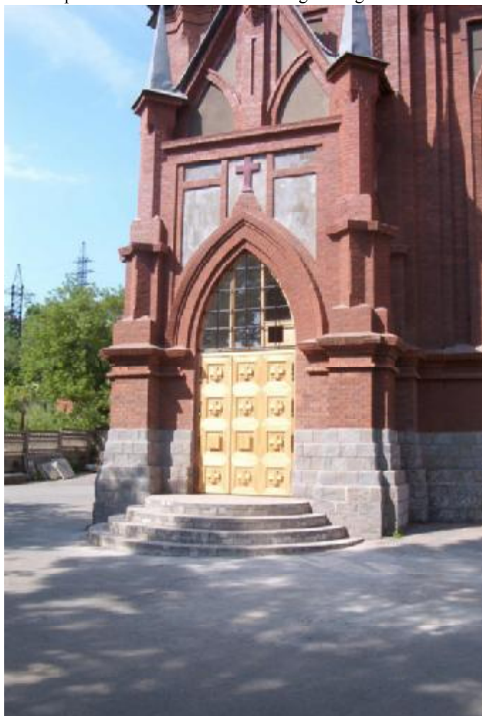
The door as it looks now, waiting for the stained glass window above it, which will be "The Flight Into Egypt".

two steeples. 3. Put on a new roof and guttering.