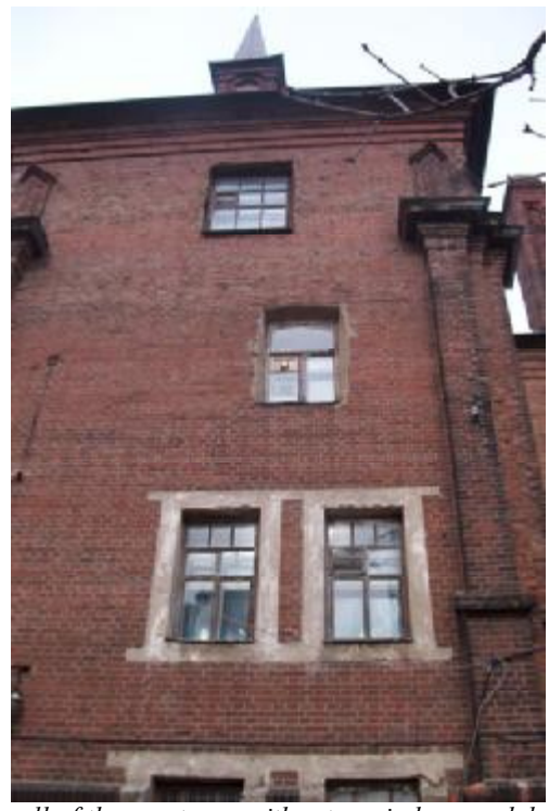
The back wall of the sanctuary with extra windows and doors as it was during the archive period.

The nearly repaired back wall. There are still some light patches to be darkened, electric wiring to be changed, and stone facing to be placed over the old door opening.