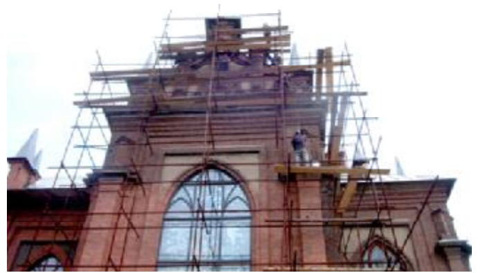
One of the Chinese workers loved to work on the very highest places, and sang while he worked. The workers were grateful for our prayers for their safety while they worked high on the building.