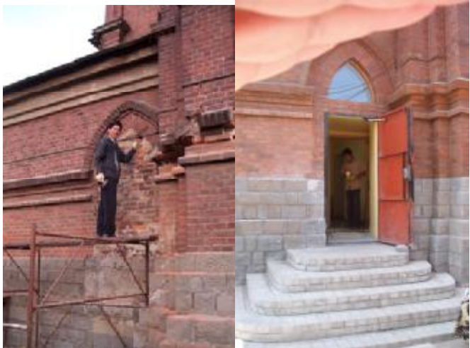
Remember this old bricked-up door? Here it is now—the main door to the sacristy.