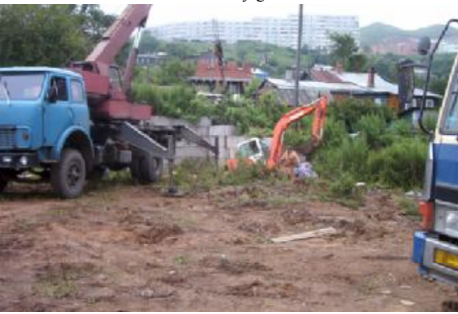
Backhoe going, going, gone!

The backhoe started digging a drainage ditch and suddenly found itself sinking out of sight into a small "swamp" on the corner of the property! Try as it might, it could not crawl out of its watery sinkhole. Finally we had to bring in a huge crane to extract the backhoe from its watery grave.