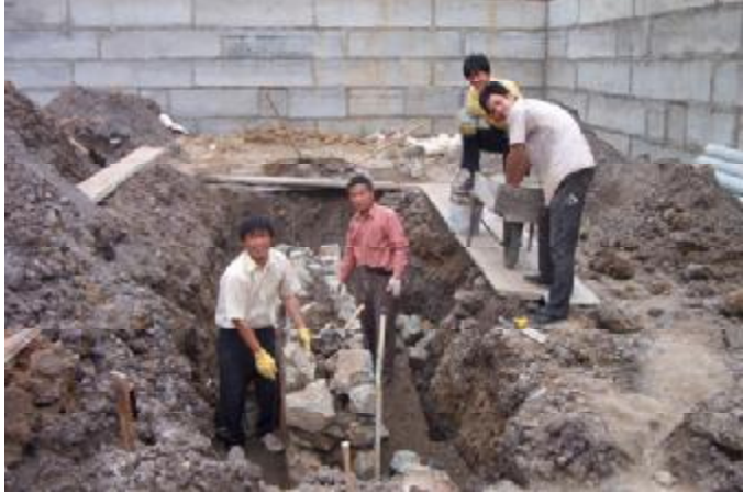
Most of our Chinese workers are family men with their families in Peking waiting for their return.