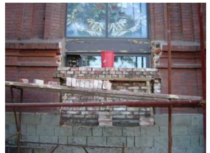
Windows which had been broken into the church walls had to be closed up.

After the work was done, if you didn't know about it you wouldn't notice the repair job.