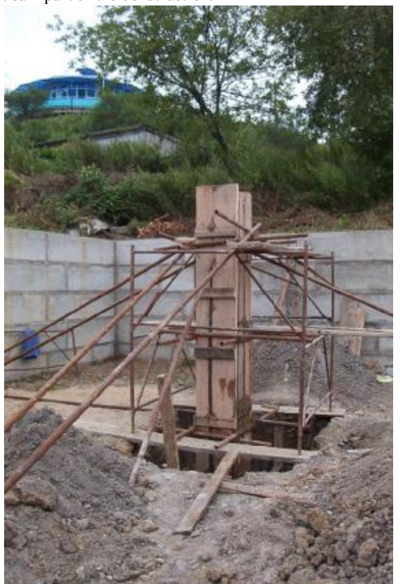
The first pillar of the two-storey building and basement is rising toward the sky.

We at last received the building permit for Our Lady of Fatima rectory and parish office building on August 6! And the Chinese workers went to work on the new building almost instantly. They want to see how much they can get done before their visas expire. The first task was of course the foundation, but that took just about a week and then began the pillar and wall construction. We will let you know as the work progresses, and we hope to have a list of benefactors for the project ready when the construction is complete. Here is a photo of the first "vertical" part of the construction.