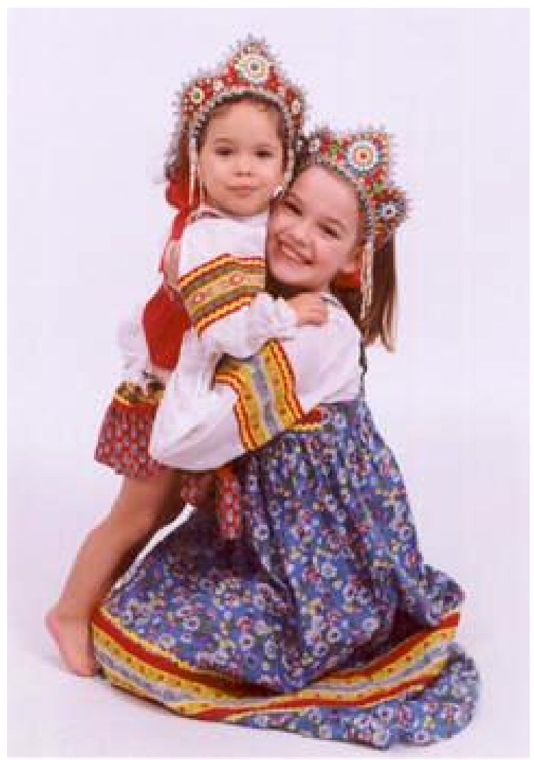
Who are these "dolls?" See Page 3

Leaflet Missal here in St Paul, a religious book and gift store with an international clientele, asked their engineer to come in, donating his day, to prepare the machine for shipment. They purchased $200 worth of wood and made a crate to insure this