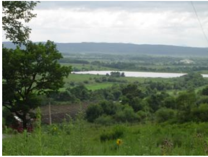
The setting for the conference was a beautiful countryside near the City of Arsenyev where Annunciation Parish is located.