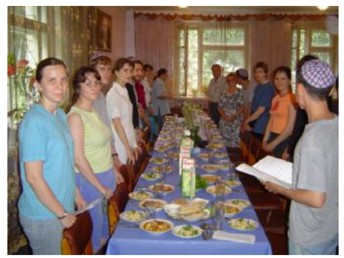
Getting ready for the Seder meal like on Holy Thursday.

The Youth Conference was a big success this year. The topic of the Youth Conference was "The Holy Eucharist" which reflects the Vatican's theme of the year and the Holy Fathers trip to Germany. Our young people had told us that our conferences are maybe too abstract and theological, so this year we made a special effort to make them more concrete and real. So, for example, my first "talk," which was supposed to be on the theme of "The Eucharist as Sacrifice," was not a talk at all--I wrote a play, and it was performed during my hour. (If you'd like