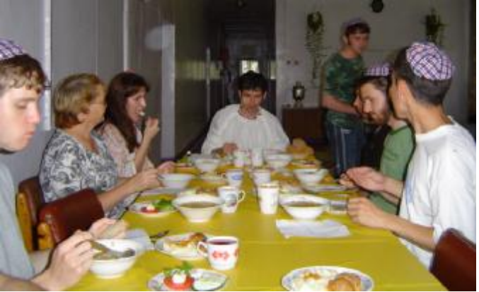
Jesus eating with tax collectors and sinners.