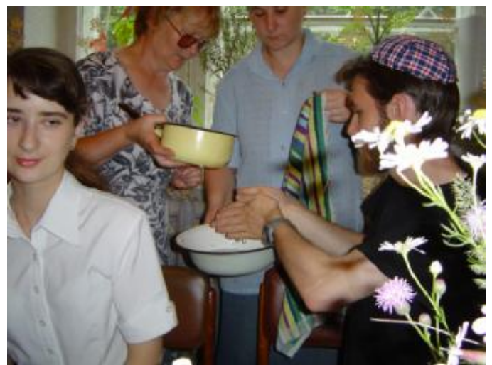
"Why do your disciples eat without washing their hands?

Our thanks to RENOVABIS, an organization of the German Bishops, for offering financial support for the Youth Conference.