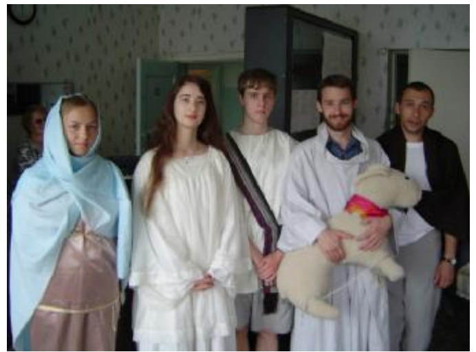
The marriage at Cana. Not enough wine!