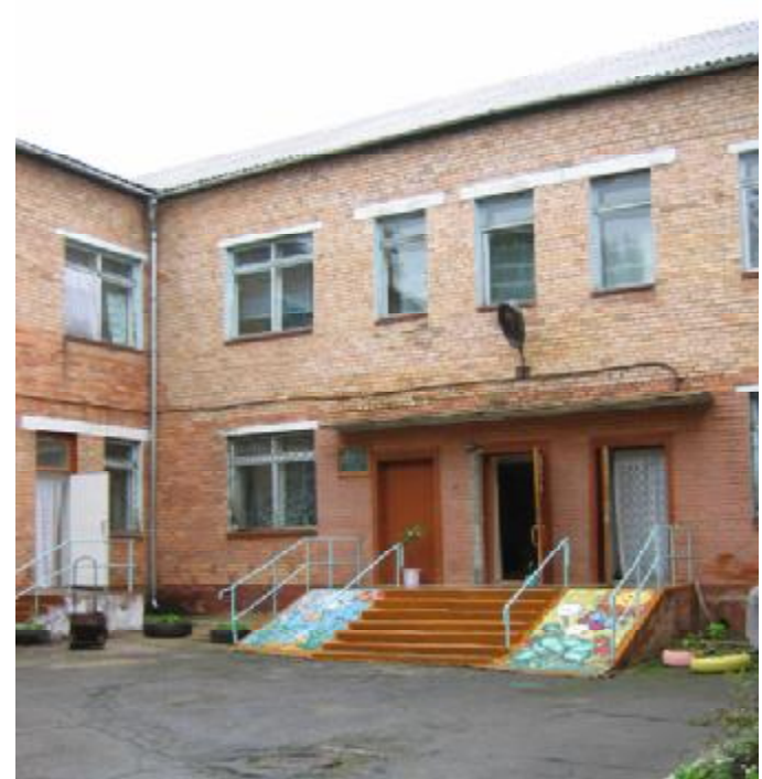
The Children's Home in Artyom.