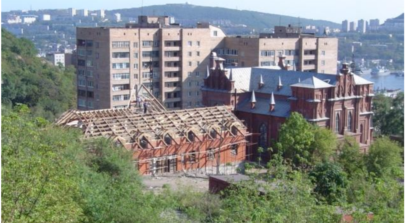
The Our Lady of Fatima Monastery and Pastoral Center taking shape beside the church in Vladivostok.