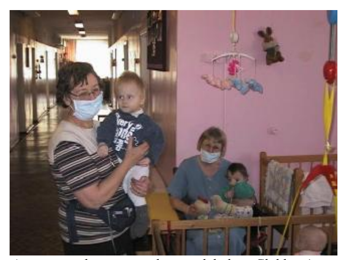
American volunteers working with kids at Children's Hospital #3

wrote us that her child had rickets when she arrived in America after adoption, something that could be ameliorated by regular exposure to sunlight. But the staff at the orphanage is so overworked that they don't have time to take the children into the sun very often unless our volunteers help out. Also the cold weather for a good part of the year here makes solar exposure for infants more of a problem. In Russia there isn't "Vitamin D Milk," either.