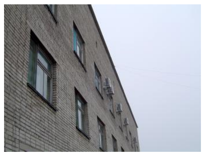
Air Conditioners on the top floor of Children's Hospital #3, thanks to Immaculate Conception Parish in Dayton, Ohio, and to the Ohio St Vincent de Paul Societies.