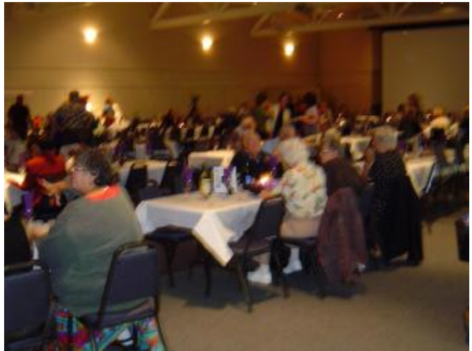
The huge Father O'Hare Hall was full for the event.