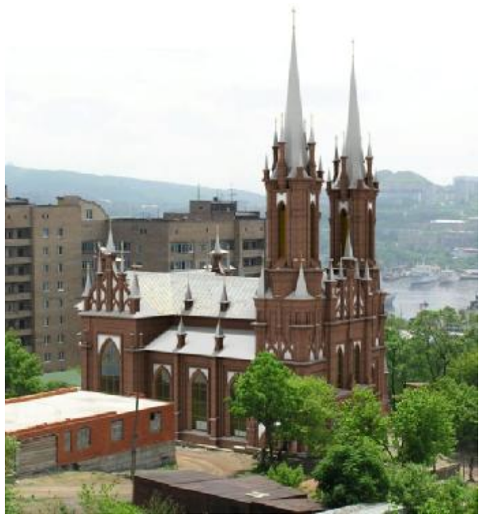
Architect's presentation of what the church will look like when the steeples are completed. Begun in 1908, will it be completed in 2007?

• We will hold our 4<sup>th</sup> National Conference at St Joseph Husband of Mary Parish in Las Vegas on Oct 19-20-21, 2007. It is titled: Conference on the Peoples and Catholics of the Far East of Russia. It will be very interesting. (Continued on Page 7)