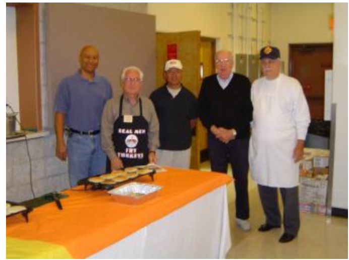
The Knights of Columbus served us breakfast.