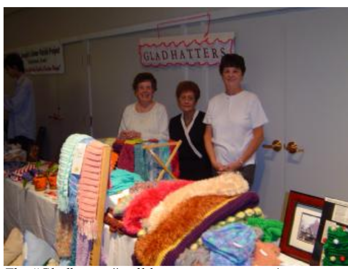
The "Gladhatters" will keep your ears warm!