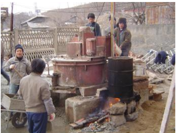
Mixing concrete for the new floor.

The new concrete floor on which heating coils will be laid.