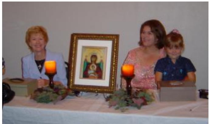
Would you like a chance on this beautiful icon?