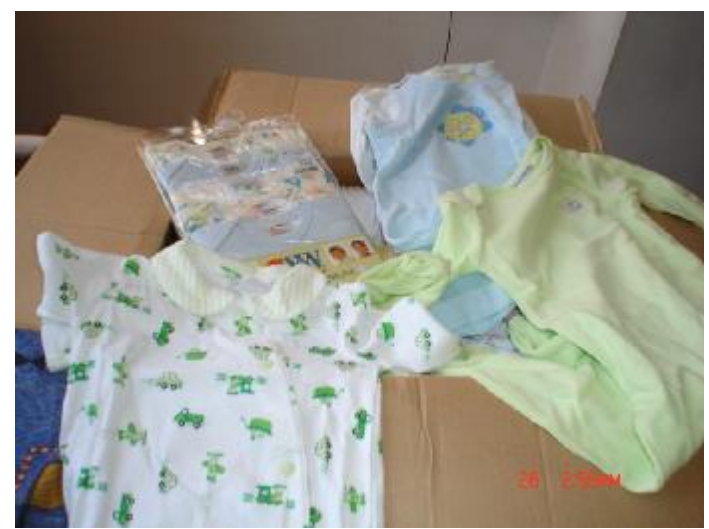
American visitors bring children's clothing for the Centers.

directors of the Centers and all the Centers' directors and volunteers, we can continue to provide a necessary service, a beautiful and important service to our society in which the scourge of elective abortion continuous to grow at an alarming rate.