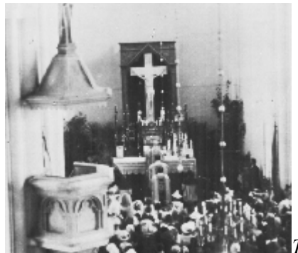
The Crucifix in 1922.

May 14 was an historic day for us! As part of the church restoration we placed the heavy marble crucifix back in the same spot it had occupied in 1922 when the church was consecrated!