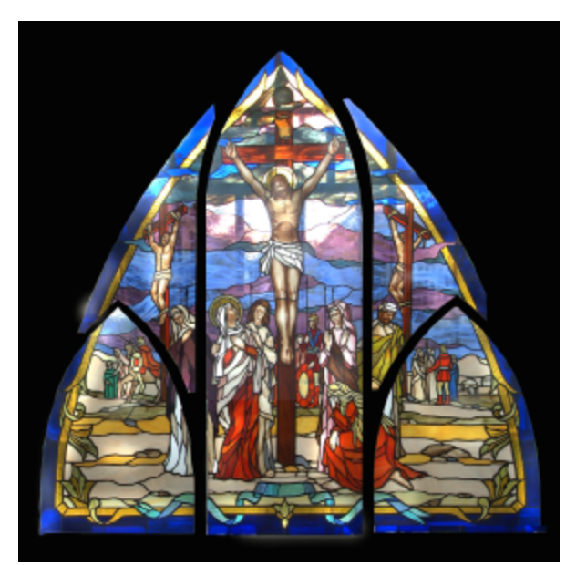
The Crucifixion Window for the Chapel, gift of the late John Bold, Vista, CA