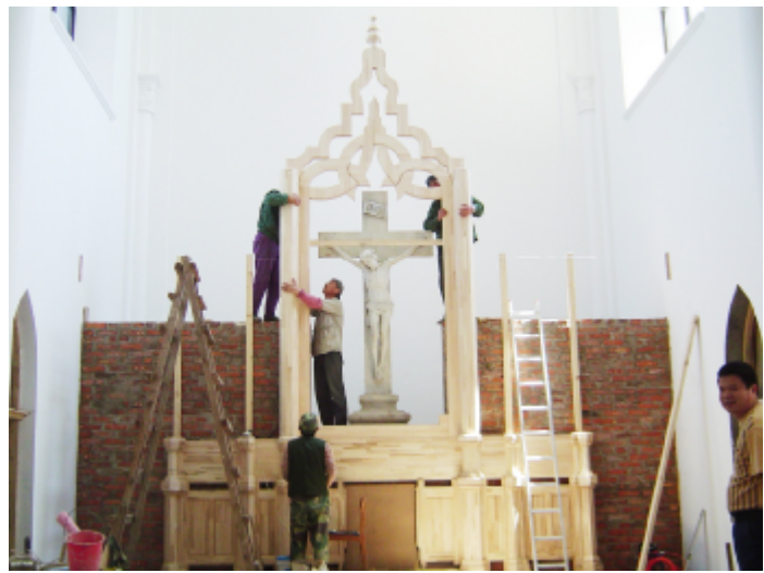
The raredos begins to rise.

Here are the latest photos as the carpenters begin to install the lower raredos into place.