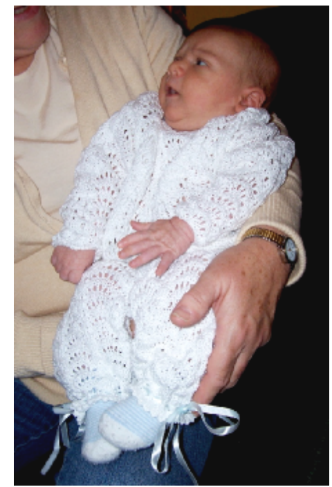
This is a 1-piece jumpsuit with pearl opening for boys, size 0-3 months.

See our gifts from Russia on our web site for more samples. Soon many different styles and stitch patterns will be available on e-bay under "baptismal gowns". Watch the site for new items. What you see on our site or on e-bay is what we have in stock.