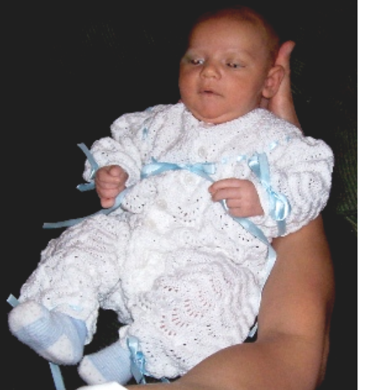
Pink is available, too, but not for Sam.