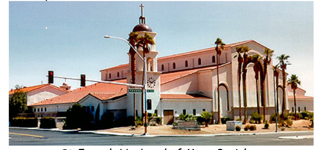
St Joseph Husband of Mary Parish.

Rate: $99/night Booking Code: MMG (Standard room with two queen beds, non-smoking) Note: In order to receive the group rate reservations must be made by 9/19/07. The hotel is 1.71 miles from St, Joseph, Husband of Mary Parish, conference headquarters.