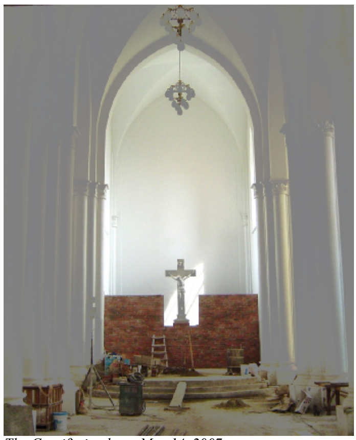
The Crucifix in place, May 14, 2007.

The plan for the tabernacle screen around the Crucifix.