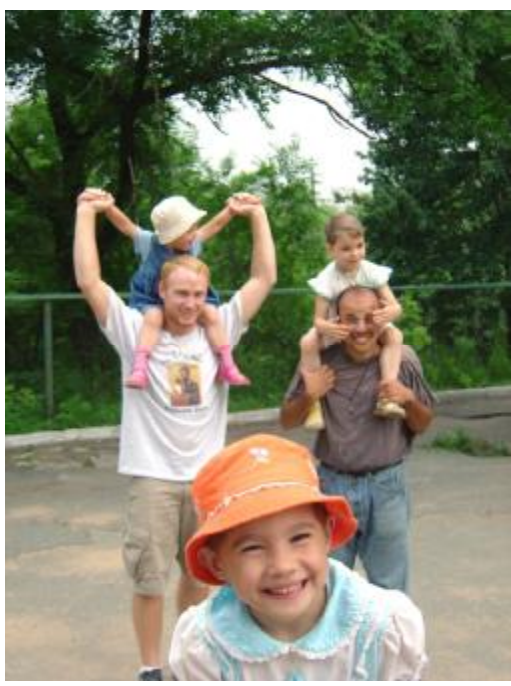
This exercise will work wonders for your detachment syndrome!