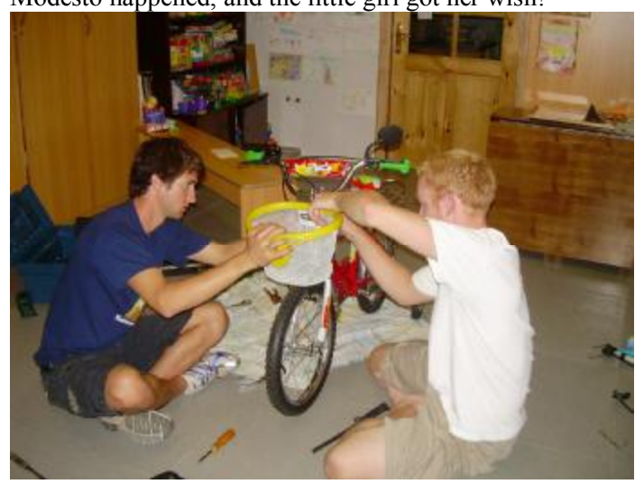
"Dads" put together a bike for a little girl.

Yes, it was Christmas in July for a little girl who received a bicycle for Christmas, but didn't have a dad to put it together! Then the mission trip from St Joseph's Parish in Modesto happened, and the little girl got her wish!