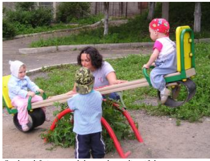
Orphan life is up and down, depending if there are volunteers.