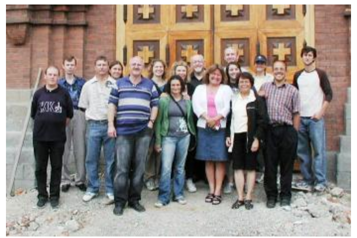
Saying our goodbyes.

Leaving a legacy, a new washing machine.