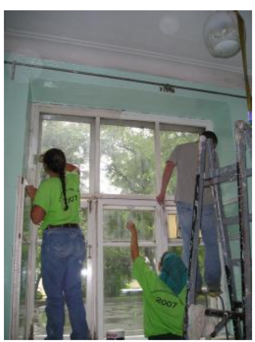
Painting the room in the hospice.