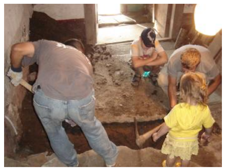
Slaving away on Russian Island, with tiny overseers.