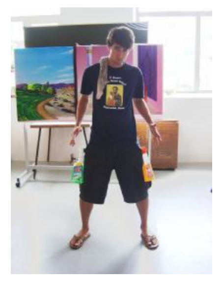
◀ Armed and ready to go.

The missionaries did so much I decided to let them tell their own story in pictures. So here we go!