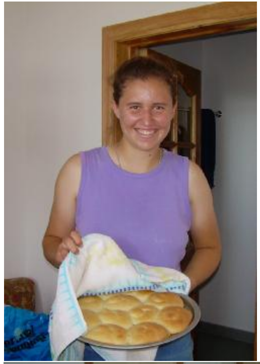
The way to a Russian's heart is by bread.