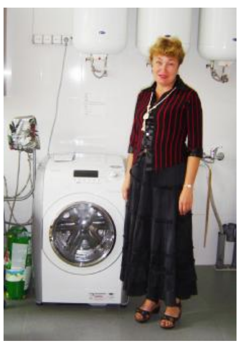
▼ The open door is waiting for you next year!

Leaving a legacy, a new washing machine.