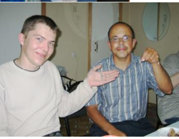
▼ "Man does not live on bread alone" so share the Gospel with a potential new Christian!