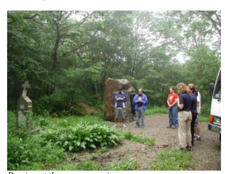
Vallpaper -ing at StJoseph'sPraying at the mass gravesite.