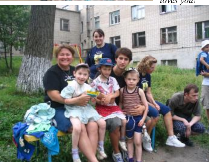
▼ Even time on the bench is fun if the volunteer loves you!