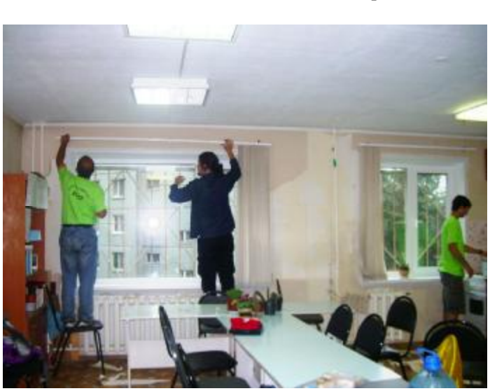
Admiring the restoration work in the church.