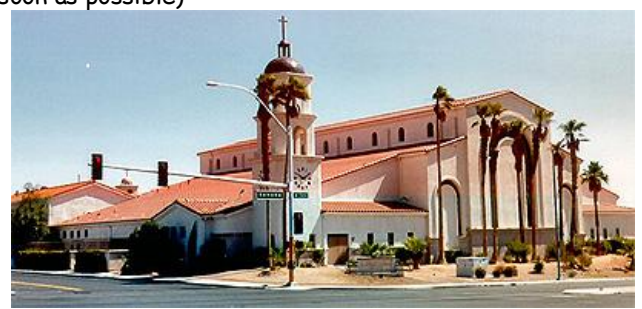
St Joseph Husband of Mary Parish.

If you wish to stay at a casino hotel, we recommend Suncoast Casino (866) 636-7111 or Red Rock Station (866) 767-7773.