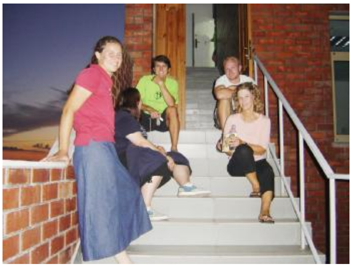
Come back Again!