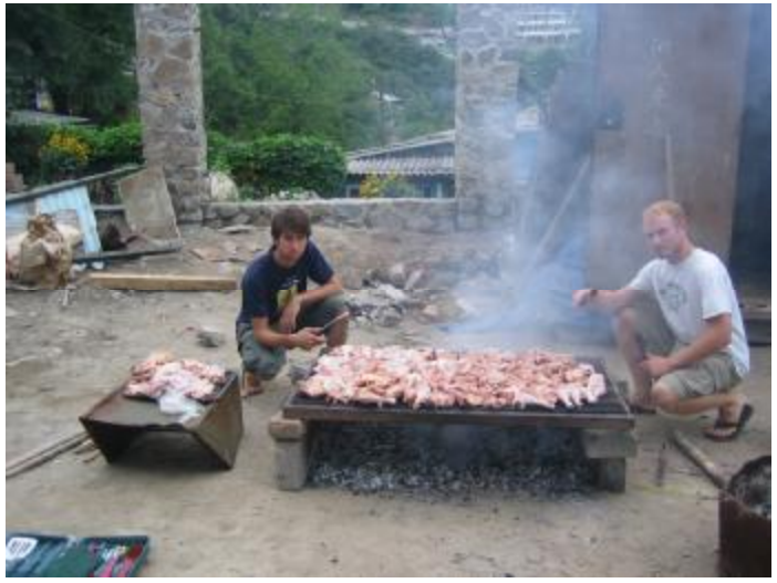
A picnic for the whole parish? You've got to be kidding!