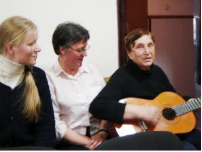
We have talents to share with others.

It helps to be reminded of the words of the songs.