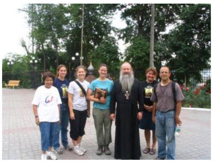
Furthering ecumenical relations.