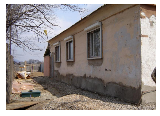
The side yard and back yard in the back-ground.

The exact date of the blessing and grand opening of the center is not yet known. The sisters hope that it will be ready by the new school year, but that depends in part on the availability of the remaining necessary $20,000.