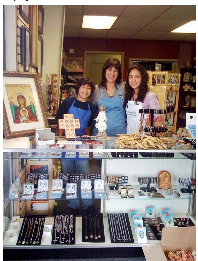
Smiling faces will surely attract customers!

Proceeds from Annunciation Religious Gifts go back to the mission whether in more merchandise or to the mission in Vladivostok. (See Development Desk on pg 8.) Not only do we carry Russian icons, baptismal gowns and gifts from Russia, we have Mystic Monk Coffee, Fair Trade tea and gifts, books, CDs, DVDs, statues. We have hand crafted items from monasteries and convents throughout the US to help the religious communities while helping our mission.