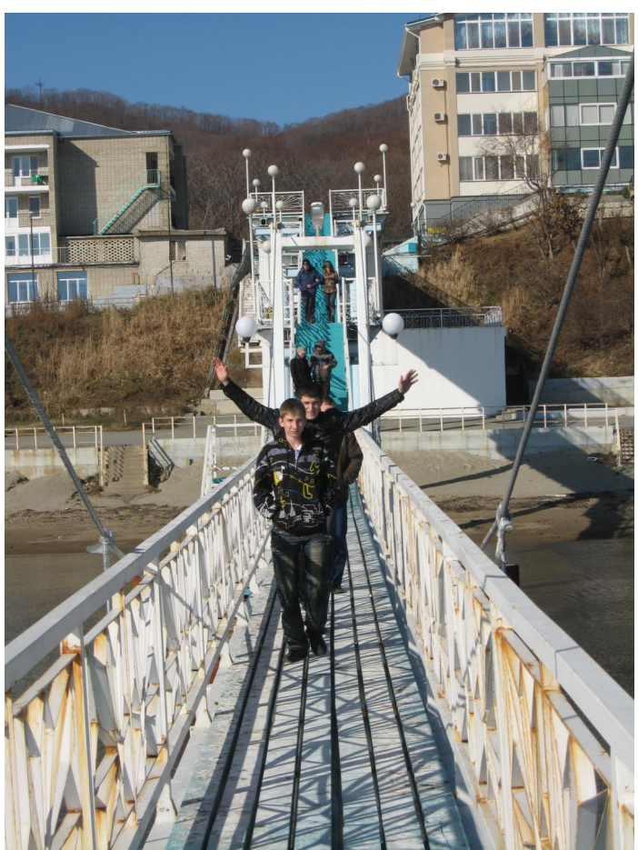
The walkbridge for students over the construction site of the new "Golden Gate" bridge in downtown Vladivostok.

Far East. Besides keeping and extending all current programs of the both indirect and direct evangelization such as a movie-club, culture and literature club, and Bible studies, we plan on organizing an annual Christian-values oriented photo contest for students. We also plan to perform a pro-life play which would involve local drama students. Because of the youth's desire for an active lifestyle we are going to start some sporting events and hiking pilgrimages.