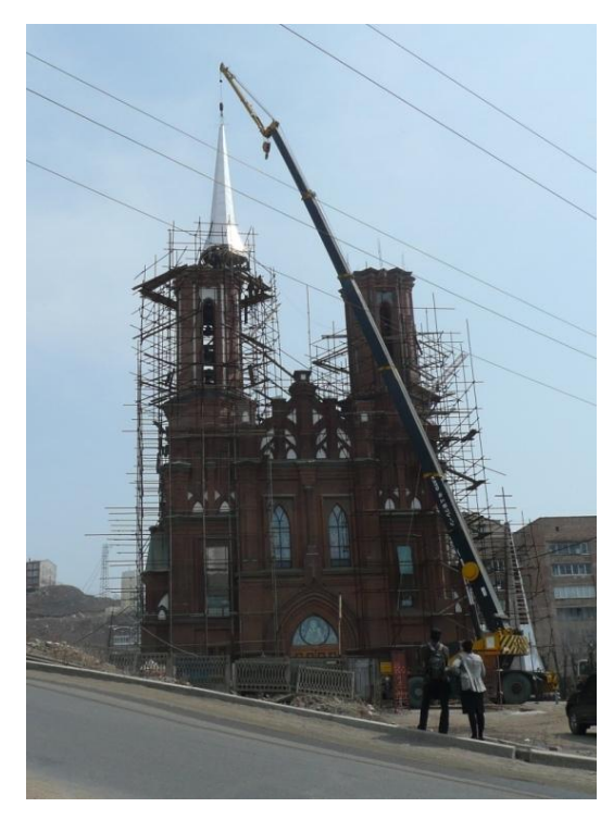
Two television crews were here to film the event— another "evangelization" event. There was a five minute report on local television.

• Happy Easter!! On April 13 we raised the first major spire to the top of the first steeple! It was a great day for us, following on the Easter Vigil which was just super, and the Easter Sunday's.