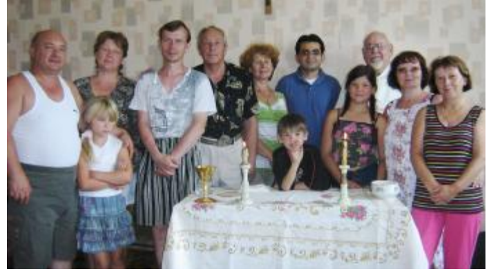
Holy Mass is always a highlight of every retreat.

their young years when religion was forbidden here. We would be able to do more of them--unfortunately we weren't able to have an Omega retreat for university students this year--but we need more space and facilities to do them. We are hoping that our premises on Russian Island can be expanded and renovated for this purpose. Once the new bridge being constructed to the Island—to be completed by 2012—the Island will be regularly accessible by car and bus--An ideal place for retreats and weekend happenings for our growing parishes and their spiritual and catechetical needs.