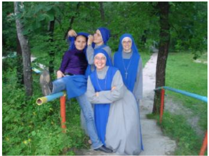
The new sisters for Khabarovsk arrived in Russia just in time for the Conference. They are Sisters of the Incarnate Word from Ukraine. Here three of them are teasing a participant by showing they are ready to dress her in their habit.

You CAN learn something about the Gospel from the TV provided you produce your own program.