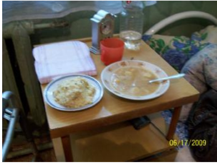
A typical hospice meal.

Besides our volunteers, this is an expression of thanks to those benefactors who help us care for these poor people. The patients need such simple things as house slippers, bibs, pajama bottoms, and housecoats.