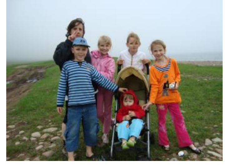
There were a few chilly days.