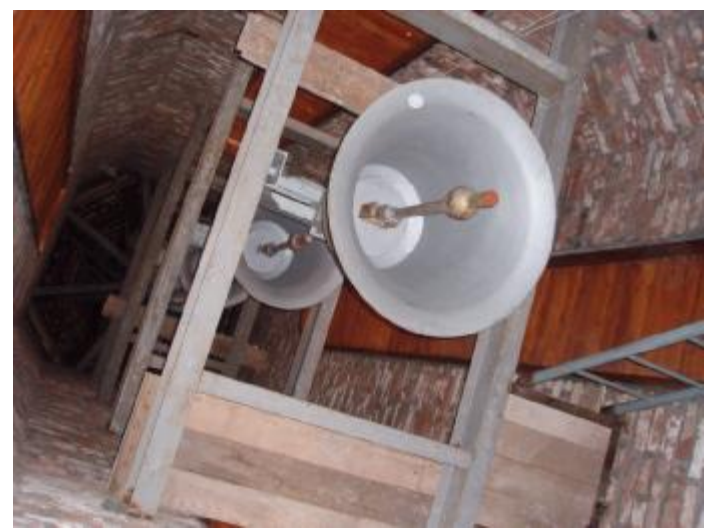
Looking up into the steeples with our four bells hanging, hoping to sound soon.

• The bells aren't ringing yet! The steeples are almost done. They are working on the last spires, and then they will work on the transept spires. We are anxious to have the final blessing when the bishop can come and we can say "Amen" to the church restoration program—a long 16 years! I was wondering how to thank those who have being praying and hoping with us to finish this great project. Maybe you have an idea for me?