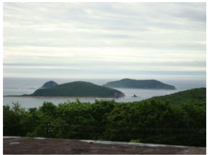
The Vladivostok Islands are beautiful in the summer.