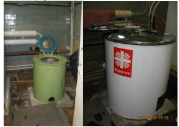
The old centrifuge and the new one.