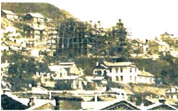
The church surrounded by scaffolds. The only photo we have from the time of the construction of the church, probably from about the time the letter was written.

As if all of that isn't interesting enough, we were told the following information about "Rolf Geiling", who was the leader of the final work on the church and author of the letter: