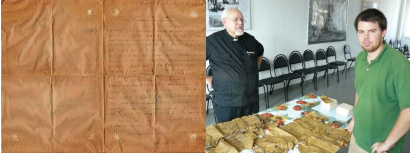
The letter as found.

In July, when our workers were removing an old metal spire from the front façade of our church in preparation for replacing it with a new stainless steel one, they were surprised to find a letter hidden beneath it! It is a letter from the men who worked on the church building in 1919. The letter lay under the metal spire for 90 years! It was in German. They said that they were German prisoners of war (WWI) who were released to work on the church building. There is a list of names, including two men who fell from the scaffold on September 18, 1919 and were presumably killed. (We are grateful to God that none of the Chinese workers fell from the scaffolding when we built the steeples this past year.) There was also included a newspaper with Communist propaganda from 1917. It is all very fascinating for us, as we only heard that the Czech Army helped finish the church. Pastor Brokmann, the pastor of St Paul's Lutheran Church here in Vladivostok, German, translated the letter for us.