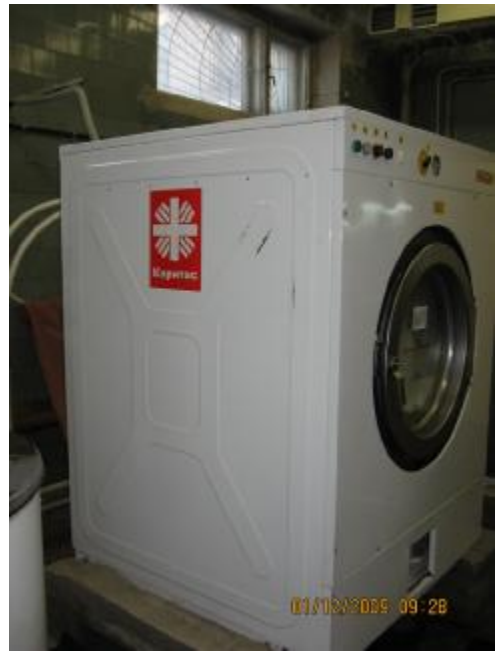
The new washer

The beneficiaries are the kids at Hospital #3, one in the arms of our volunteer "Grandma Valeria."