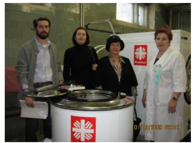
The Caritas team supervising the installation, and the head doctor of Hospital #3.