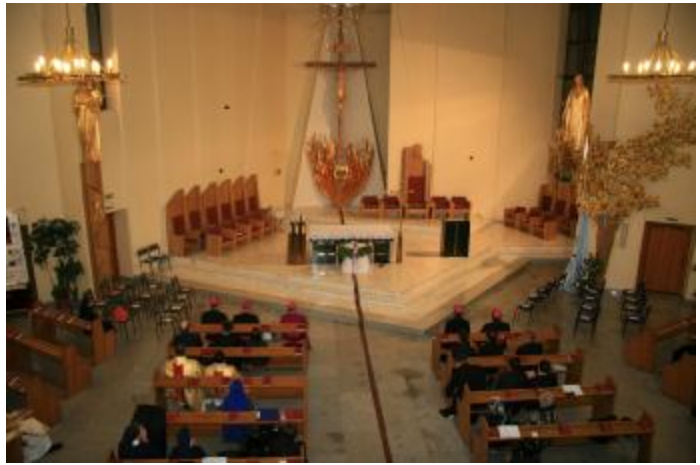
The Cathedral in Irkutsk