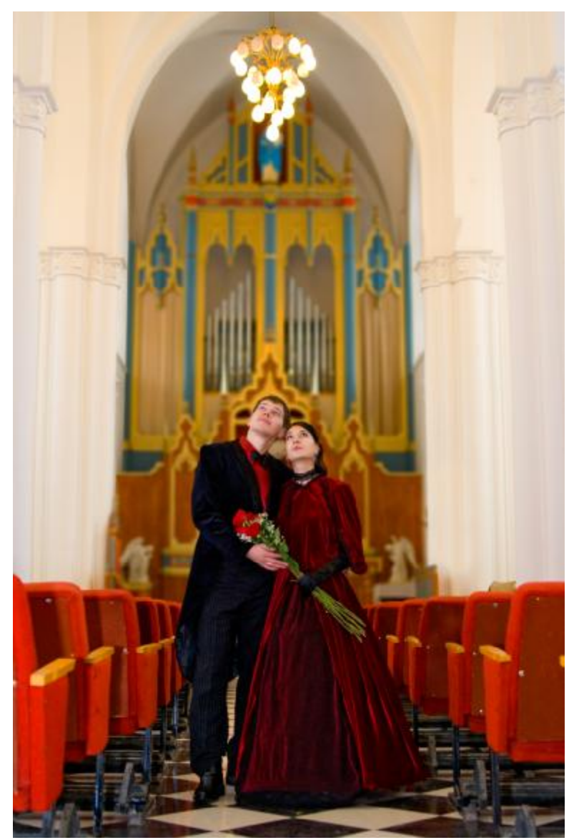
Sometimes couples ask to do their wedding photos in our church because they like it so much. This couple really impressed us with their upward gaze to God in the Gothic church which calls our minds and hearts upward.

Between November 2009 and April 2010 I participated as priest-chaplain in 3 retreats called Rachel's Vineyard . They took place on weekends from Friday evening to Sunday afternoon.