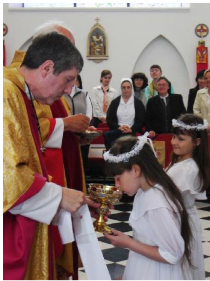
Anastasia received the Precious blood from the chalice.