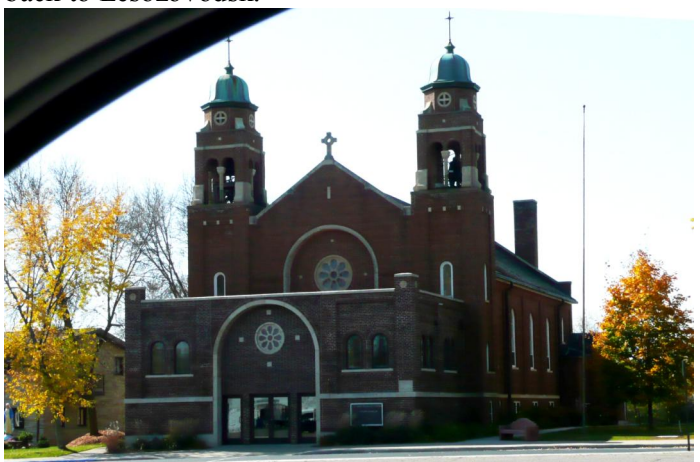
St John the Baptist Church is well cared for in the center of Edgar.

I was delighted when I heard that St John the Baptist Church in Edgar, Wisconsin, wanted to be a sister parish to Visitation Parish in Lesozovodsk. Both parishes are in the center of their states, both are largely rural areas, both have a history of forestry ("Lesozovodsk" even means "wood factory."), and we could hope to have a wonderful relationship like St Philip Benizi Parish in Oregon has with Holy Family Parish in Romanovka. So I made arrangements to visit Edgar during my Fall trip to the USA. I was somewhat exhausted from my 12 hour flight across the Pacific, but really enjoyed the Fall colors in Wisconsin. (We don't have maple trees in Russia.) The parish was very welcoming, and even had special Indian corn Fall decorations for sale to benefit the sister parish. We'll look forward to a good relationship, and hope that visitors from the parish can some day visit us in Lesozovodsk. Naturally I took lots of pictures to bring back to Lesozovodsk.