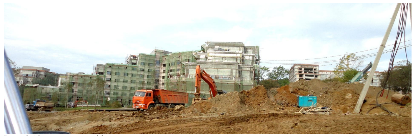
Central Administration Building

The gigantic size of the buildings shows by comparison with the four huge cranes used for construction.