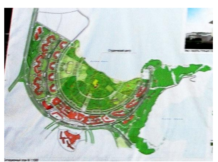
A map showing the new campus of Far Eastern Federal University. The red zones are new buildings.

We've mentioned Russian Island many times in these pages, as we have had many retreats there, and AA uses it for their rehabilitation programs. Now the new Far Eastern Federal University will be there, about a mile from our facilities. Naturally we are hoping to open a Women's Support Center near the university, and provide spiritual and evangelization programs for students. Chances are good that there will be many Catholic students at the university, as it is expected to draw students from all over the Pacific, including the more Catholic countries of the Philippines, of South Korea, and even South America. We have to get ready.