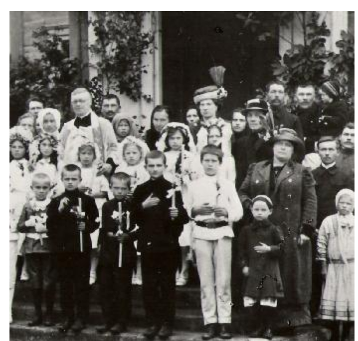
See the offending hat in the open doorway of the temporary church in about 1921.

A moment of fun came when the sisters told about their grandmother's recalling that the boys of the parish used to joke about a certain woman parishioner's hat. I was happy to how them a photo of the hat!!