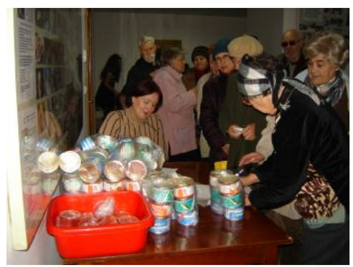
Seniors receiving canned fish and honey

Sometimes we serve walk-in needs , and we cooperate with local social institutions. We distributed: