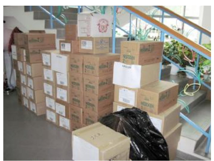
Stacks of baby food and supplies supplied by Renovabis

One participant in a Rachael's Vineyard retreat said, "During the retreat my feelings inside me were changed as was my attitude to my children who died because of abortion. I could mourn the loss of every one of my children who died, and I could share my sorrow with the other participants of the retreat. I could say goodbye to my children and forgive myself. The Rachael's Vineyard retreats help me to be free from those sins that I did."