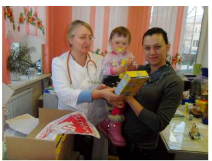
Single mother visits the Center at the City of Vladivostok Women's Consultation Service

Alcoholism and drugs among men is the number one social problem in Russia. Women face the economic strain of feeding themselves and their children in small apartments in poor economic situations where many do not receive welfare for their children. The Russian government is doing a lot of the right things to make sure the economical situation stays stable, especially for families, but there is still a lot to do.