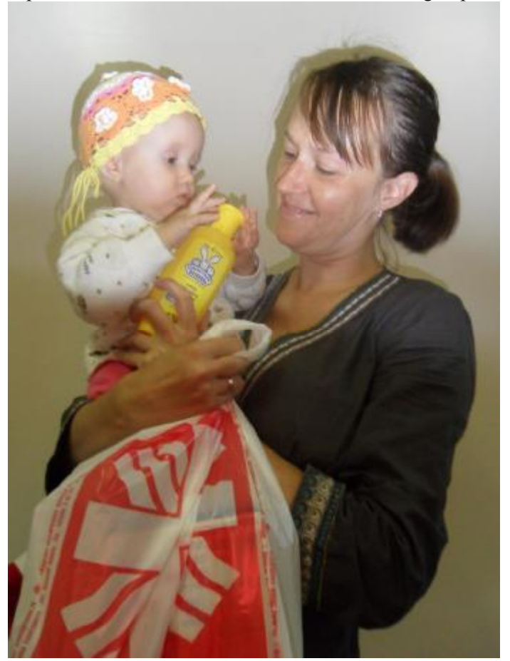
Young mom getting the help she needs.

Perhaps this is a place where we can speak a bit about the work in other parishes. At the Parish of Our Lady of the Pacific in Nakhodka the Grandma Mentoring Program is also functioning, with three regular volunteers visiting the orphans. In Lesozovodsk , at Visitation Parish, a group of