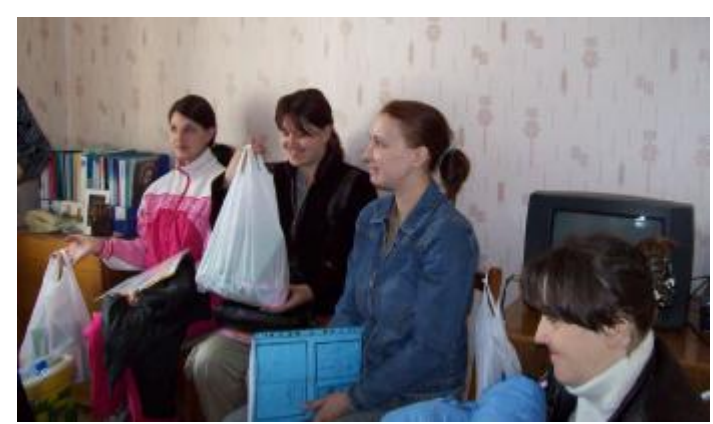
Aid for women who recently gave birth, at the WSC of the city of Arsenyev

assist our clients with baby food, diapers, medications, and baby clothing. We also provide clients with referrals to medical personnel as well as counseling about Natural Family Planning (NFP) including the Billings Method and the Sympto-thermal Method, STDs, chastity, and family values. Our clients were also provided free used children's and women's clothing and other items that we might have available.