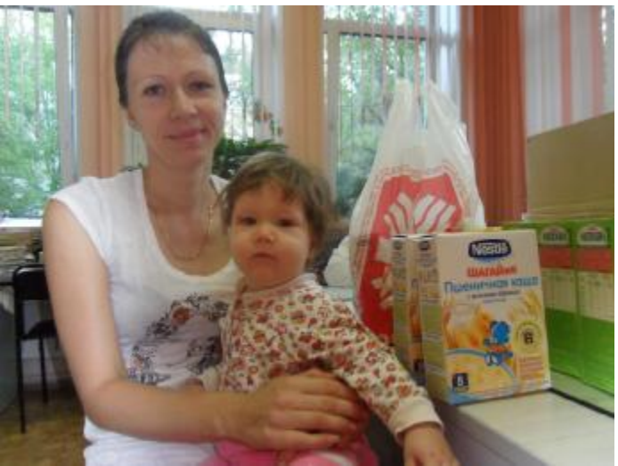
A smile and a bag of humanitarian aid in Second River

Caritas Women's Support Centers continue to cooperate with other local institutions promoting the idea of saving the lives of pre-born babies and of strengthening the family. We appreciate the organizations which participated in the WSC's programs, including the Departments of Social Protection of Soviet and Lenin Counties of Vladivostok, the Regional Clinical Center of AIDS Prevention, Maternity Hospital #3 (Vladivostok), local hospitals in Arsenyev and Lesozovodsk, State Women's Consultative Clinics, and children's polyclinics of our counties.