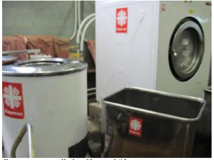
Equipment installed in Hospital #3

The Grandma Mentoring Program continued to function all year, although the number of volunteers involved in the program varied from 3 to 7 persons (3 parishioners; 3-4 foreign volunteers) depending upon which month. The number of visits to the two orphanages