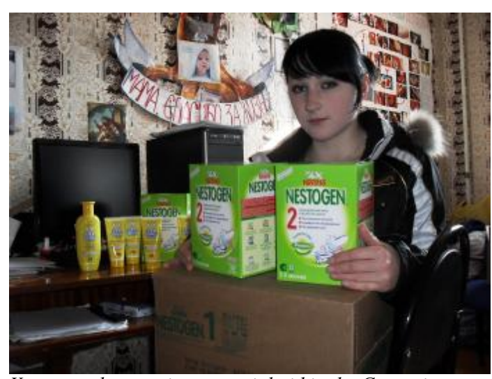
Young mother receives material aid in the Center in Nakhodka

WSCs continue the "Adopt-a-Birth" program (a medication packet for mother and baby that includes hygienic products such as baby lotion and creams, diapers, antibiotics) and "Adopt-a-Mom" program (medical help for women who have special needs at birth). In 2010 we were able to provide 144 packets.