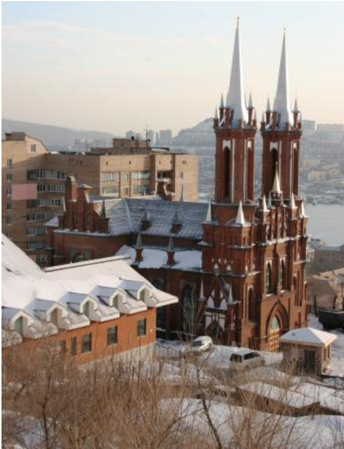
The completed steeples, with the new rectory nearby.

honor of Our Lady of Fatima, and the following day at the re-consecration of the restored church and the consecration of the new main altar during a solemn Sunday Mass. Nine priests and one deacon, hundreds of guests from area Russian parishes and foreign countries gathered for the great occasion, (VS #80).