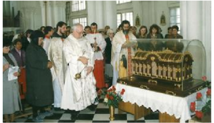
Reception of the Relics of St Therese the Little Flower

January 7, 1999: New Parish in Arsenyev , (VS #27, p 7). Fr Myron founds the Parish of the Annunciation in the city of Arsenyev (pop. 65,000) located 4 hours by car from Vladivostok. On this day the parish celebrates for the first time the baptism of new members. Fr Myron visits the parish for confessions, Mass and catechism classes once a month. Fr Christian Labanovsky, OFM takes over the parish in 2002.