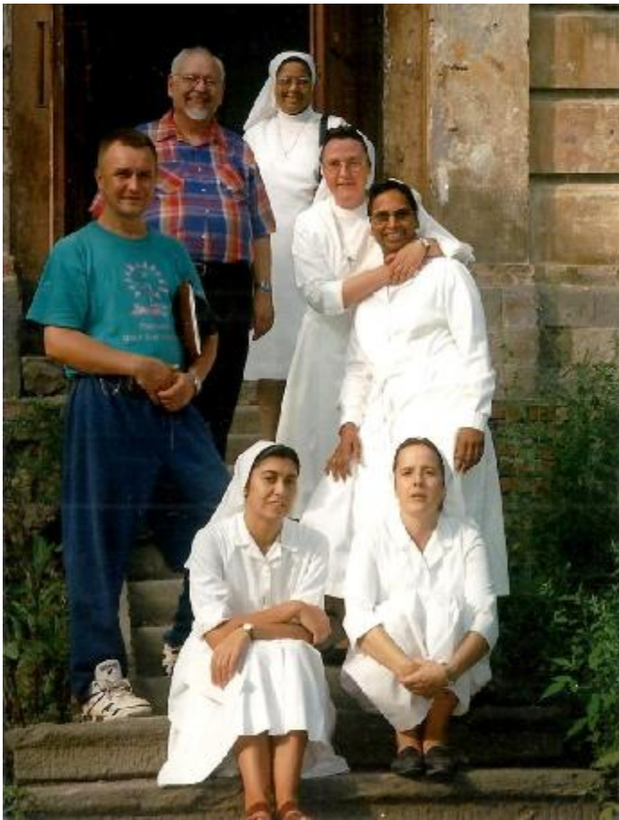
First group of Sisters of Charity of St Ann