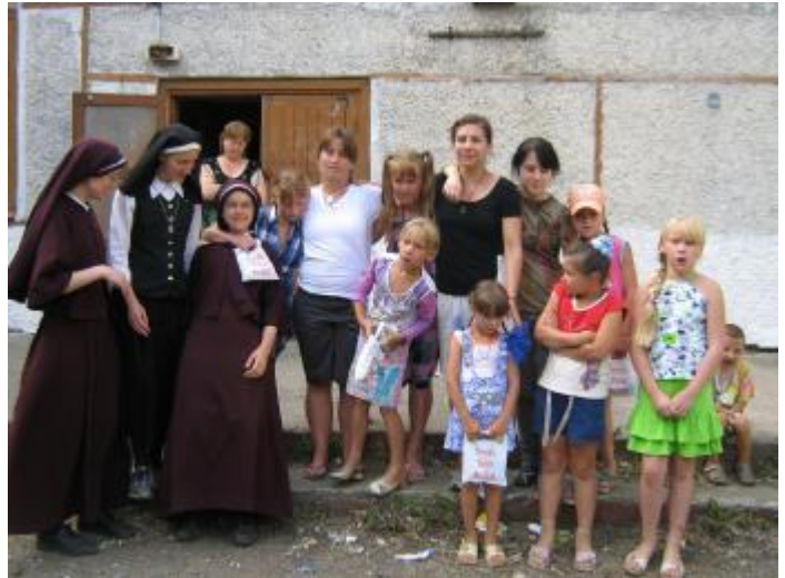
The Girl's Side