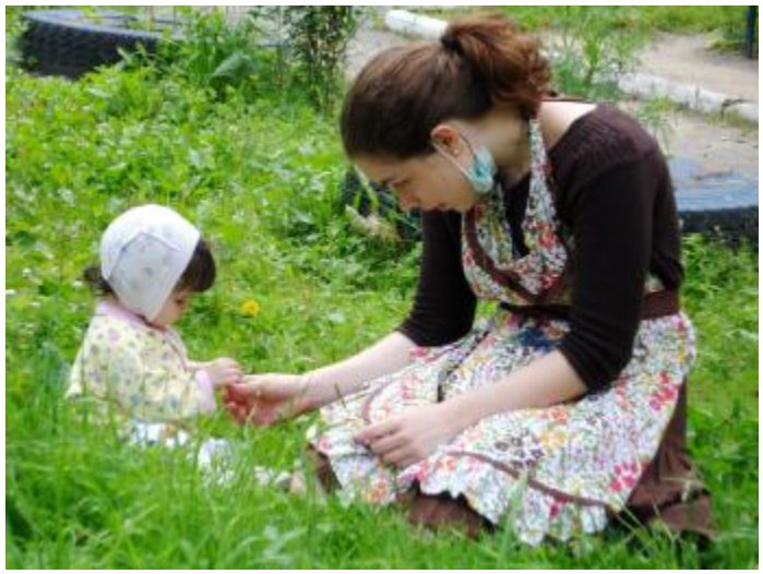
The kids can go outdoors only when there are volunteers.

After four days in Vladivostok, my half of the group traveled by bus to Nakhodka, a little city four hours away for a Catholic youth conference, while the other half remained at the youth camp. No one knew what to expect, and none of us expected what we experienced. The Conference was a big deal, with some of the Russians traveling four days by train to come. There were fifteen Russians, compared to our sixteen Americans. At the Conference, it became clear that Catholicism is discouraged in Russia, with the Orthodox criticizing and oppressing Russian Catholics. Most Catholics we met in Russia were not Catholic by birth, but by choice. Those at