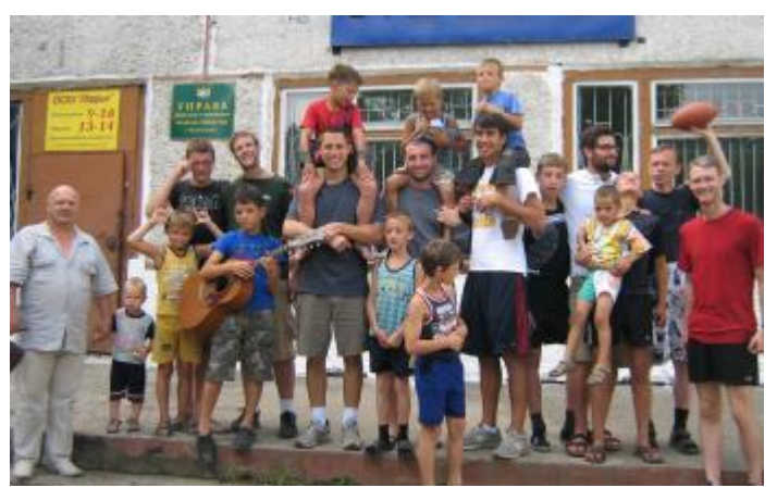
The Men's Side of the Camp in Lesozavodsk

Thank you for making my Russian trip and its opportunities possible for me, whether through your personal encouragement, financial assistance, or prayers. I had a life-changing experience that allowed me to better know God in my life and to see Him in others.