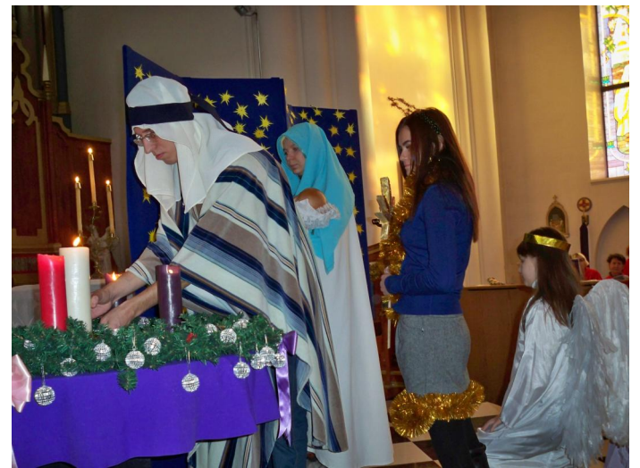
Joseph and Mary bringing the child Jesus while the angels watch—in our Christmas pageant at "Midnight" Mass.

didn't know what to do, I was left only with 10 pesos, that is less that a quarter dollar, I used that 10 pesos to come home here, and just 5 minutes ago, I called a TV report channel, asking for help, they already called the police for me, I also called the bank, to freeze my account. My wallet was stolen, with money on it about $200 and my ATM card was with it. Imagine, I was dressed in my religious habit, and still the thief had no shame to take my wallet. I do not know what to tell you. Now I am waiting for the police to call me to report the incident."