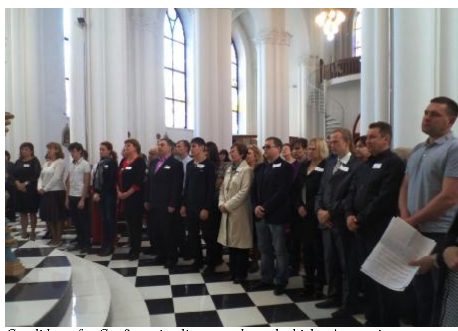
Candidates for Confirmation line up to hear the bishop's questions

Our program for baptism and confirmation of adults extends from the beginning of the school year in September until the Easter Vigil, when those as yet unbaptized receive that sacrament. Confirmation has to wait until the bishop can be here, and we were glad that he could come during the extra joy of the Easter Season.