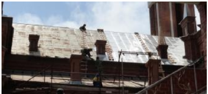
Old roof to the left; new roof to the right. Don't fall, please!

http://www.vladmission.org/donations/donations.htm Here's a photo showing the change the new roof is making.