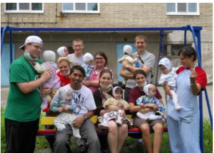
FOCUS students playing with kids at Baby Hospital #3 in the summer of 2011. We expect them again this year.

Of course to get the whole picture, we have to add the two Caritas Women's Support Centers located in Vladivostok. They have been working like clockwork helping women and kids. The other Centers are in other cities.