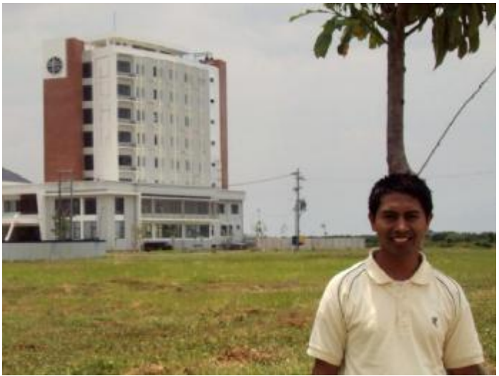
The seminary which our candidates will attend.

collected a group of experienced seminarians who want to join us who will be attending seminaries in Indonesia this year. He had a meeting with them when he was in Indonesia last month, and already organized them for this coming year or two until he is free to join them as superior. The plan is that when they finish Philosophy they will come to Russia for the novitiate. Some may like to stay and work in Russia, and others will want to return