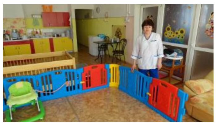
Play pen donated by Orphans At Play

for the children there. Actually it is three playpens fixed end to end to make a fence. Orphanages are a fact of life here, where the average woman has had seven abortions! You would think that with so many abortions there wouldn't be any orphans, but it doesn't work out that way.