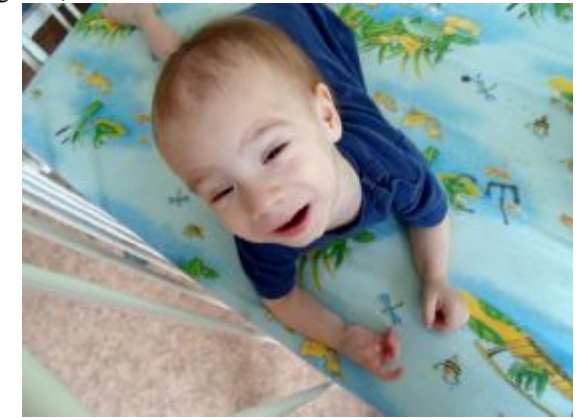
"No one has come to see me for days!" Now, thanks to the American organization "Orphans at Play" we hope to expand the Grandma program,

Detachment syndrome is what happens to a child when he isn't held, coddled, spoken to, or encouraged to develop. The result of the syndrome is people who are unable to form normal interpersonal relationships, and sometimes even who have psychoses or sociopathy. It would make sense for the government to spend money now on orphans, in order to save a lot of grief years from now when they become social problems, but governments don't usually look that far ahead. The chief way we help is through our "Grandma Mentoring Program" which has worked for many years already. We ask volunteers to go to the orphanages regularly, just to play, hold, and love the children. FOCUS (Fellowship of Catholic University Students) was a big help this summer, as the student missionaries were delighted to work with the orphans at Children's Hospital #3 in Vladivostok. The kids were delighted, too!