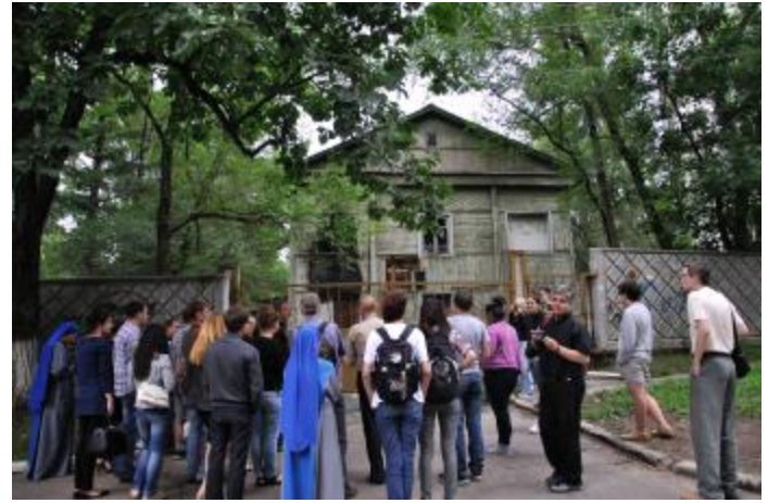
The youth visited the old Catholic church in Khabarovsk, which has still not been returned to us by the Russian government.

This was the 16<sup>th</sup> meeting of the Catholic youth of the Russian Far East! Guests came from Blagoveschensk, Vladivostok, Nakhodka, Ussurysk, Sakhalin, and Yakutia to be with parishioners from Khabarovsk. A warm atmosphere got established the first day as we got reacquainted with folks from last year, and jokes and fun were part of our experience for the whole of the conference.