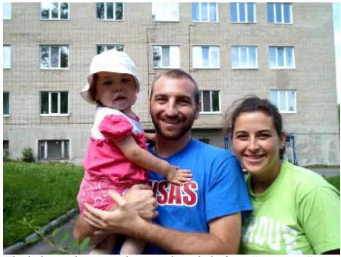
The kids rarely get outdoors without help from "grannies.

evolving as the needs evolve. As we see it now, the needs are 1. To help deal with detachment syndrome, 2. To provide physical support when needed, and 3. To offer educational opportunities to orphanage staffs.