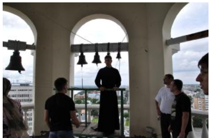
Learning about the church bells in the Orthodox cathedral.

finished our tour in the steeple where he spoke about Orthodox bellringing, and he let us try our hand at it!