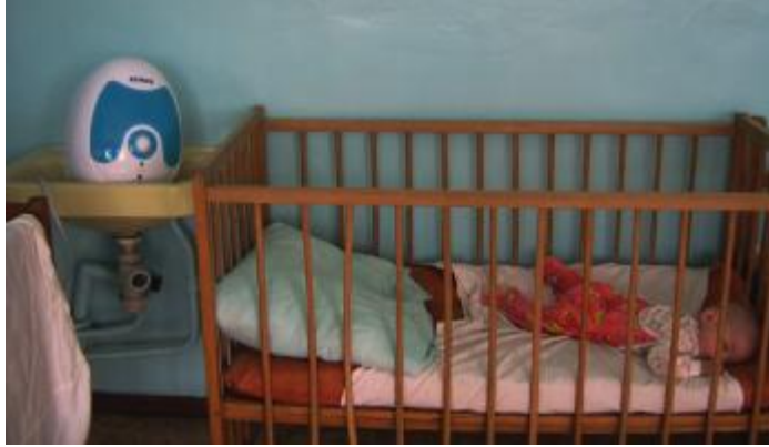
Small water heater looking like a robot peering over a child, is sitting in the sink waiting for installation.

• The City Hospital in Lesozavodsk where one of our Women's Support Centers is located sometimes asks us for help, especially in the children's department. Recently they asked for a small water heater. Here is a photo.