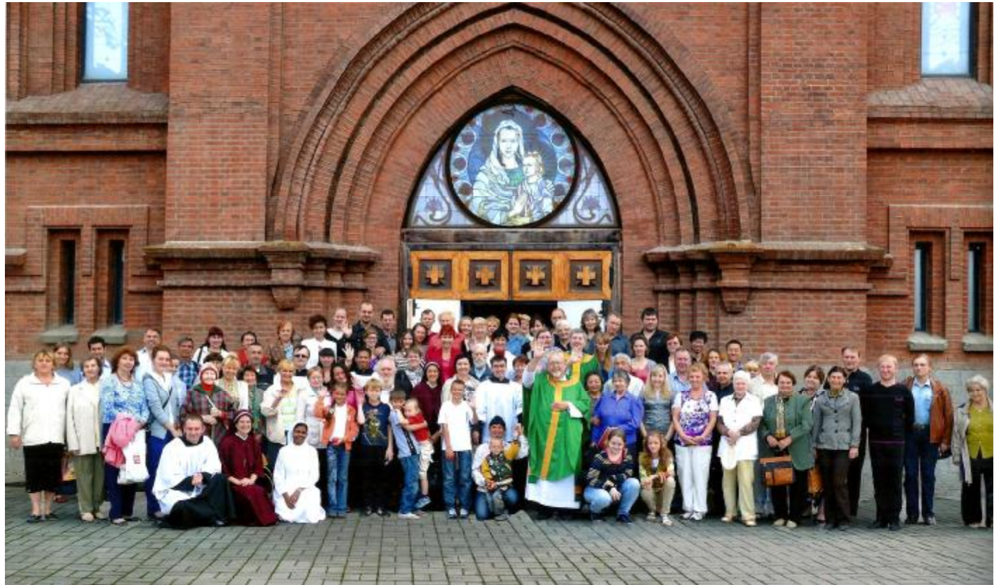
Some of our parishioners wishing you a Merry Christmas after Sunday Mass!

Russia still has many orphans, and many of them are still housed in buildings called orphanages. We've always tried to help. Earlier it was chiefly providing food, as the Russian economic crisis left the government with very little resources to take care of its social commitments. Sometimes it was providing physical resources where they were desperately needed, like air conditioners for sweltering babies' orphanage rooms, water heaters for orphanages where there was no hot water, and even whole rooms of laundry equipment where the old equipment was totally unrepairable. And our Women's Support Centers try to help women not to abort their children, and offer help for moms to care for their children when necessary, to avoid giving them up to orphanages through our Guardian Angel Program.