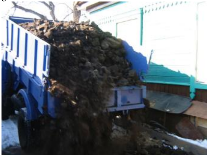
Coal delivery in Lesozavodsk.

• We were able to deliver loads of coal to desperately poor people in villages near Lesozavodsk, thanks to a generous benefactor.