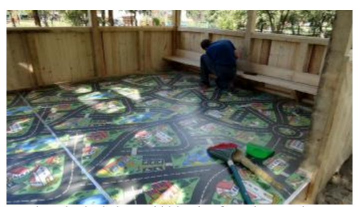
We thought the kids would like this floor design where they could play cars. It was interesting to watch the tiniest kids imitating pounding nails when the men were there working—something they had never seen before.