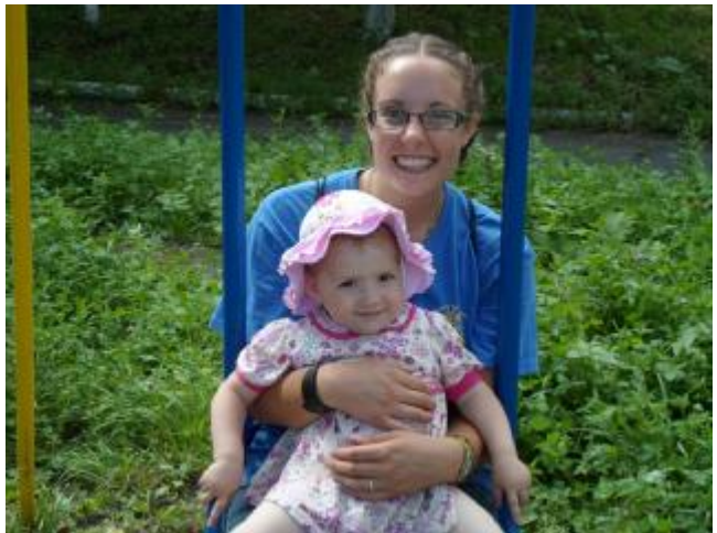
Swinging in the sun with "grandma" from FOCUS. 20 minutes of sunshine provides vital vitamin D, not to mention the "warm fuzzies".

The statistics that I've heard for orphanages are that 40% of the orphans will end up in jail. 40% will die of alcoholism. And only 20% will become normal citizens. The reason is that the Soviet system denied the spiritual side of people, and just didn't understand the importance of marriage and family life and of the personal formation of children. The reigning philosophy was that kids automatically grow up and automatically become productive citizens, if you don't spoil them with "proletarian" values. They used massive terror in Stalin's day to get ride of "kids" who were raised otherwise, in normal families.