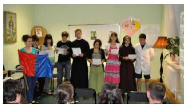
Giving a report about their saint.

The conference began with Sunday Mass on July 29, celebrated by 10 priests, eight of whom were with us for the whole conference. Then we took a tour of the city of Khabarovsk with the nuns who attended the conference. In the evening we made presentations of our home parishes for those from other cities. Then we broke up into three permanent groups, each of which was to work on promoting one saint that we were going to study all week. We were to report on the saint's biography, write a song to or about him or her, make a seal for the saint, and, in general, get very acquainted. The "green" group got St Josemaria Escriva, the founder of Opus Dei. The "purples" got St Joanna Beretta Molla who died for the sake of her unborn child. The "grays" got St Pier Giorgio Frassati, a student himself. The work details were also designated by these groups.