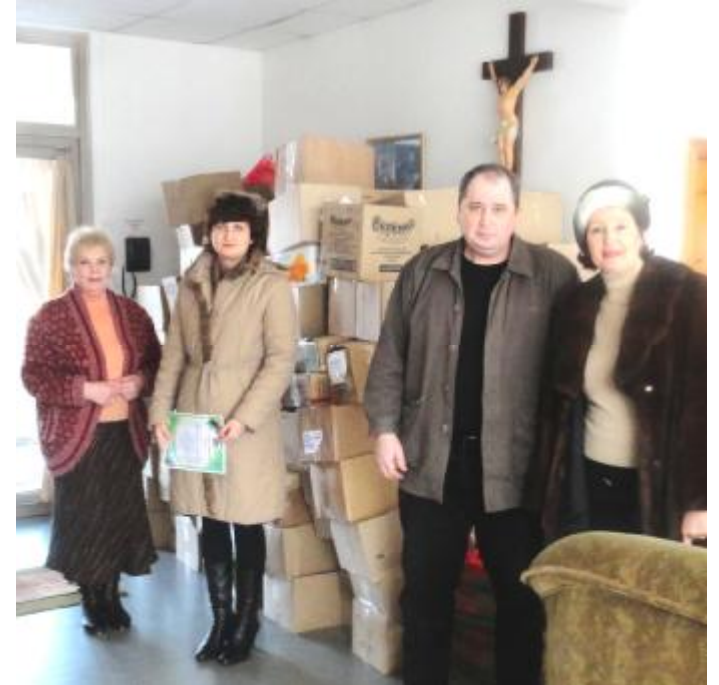
These folks are delivering boxes of food!

• It was an historic day when Pope Benedict XVI left the See of Peter. The parishioners were reacting to all the sensationalism of the Russian press, and were somewhat agitated about all of the "end of the world" hype, but we were able to calm them down at Sunday Mass. Of course