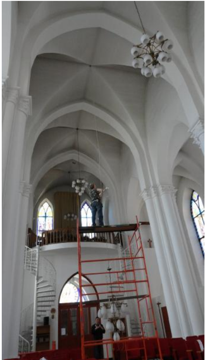
Installing the fire alarm system

with all those candles and incense! Now that the system is if we don't find or grow some. So it is exciting that there working well in the church, we will begin installing the system in the monastery building. Thanks, benefactors in America and in Russia!