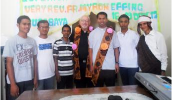
Seminarians in Surabaya greeted me and the new deacon, including one wearing a native costume.

are so many vocations nearby in the Philippines and in Indonesia, and that some of these guys want to work in Russia after ordination, and others will serve in other