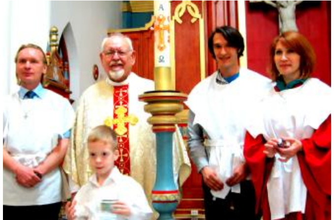
Some of those baptized at the Easter Vigil.

• It was an historic day when Pope Benedict XVI left the See of Peter. The parishioners were reacting to all the sensationalism of the Russian press, and were somewhat agitated about all of the "end of the world" hype, but we were able to calm them down at Sunday Mass. Of course