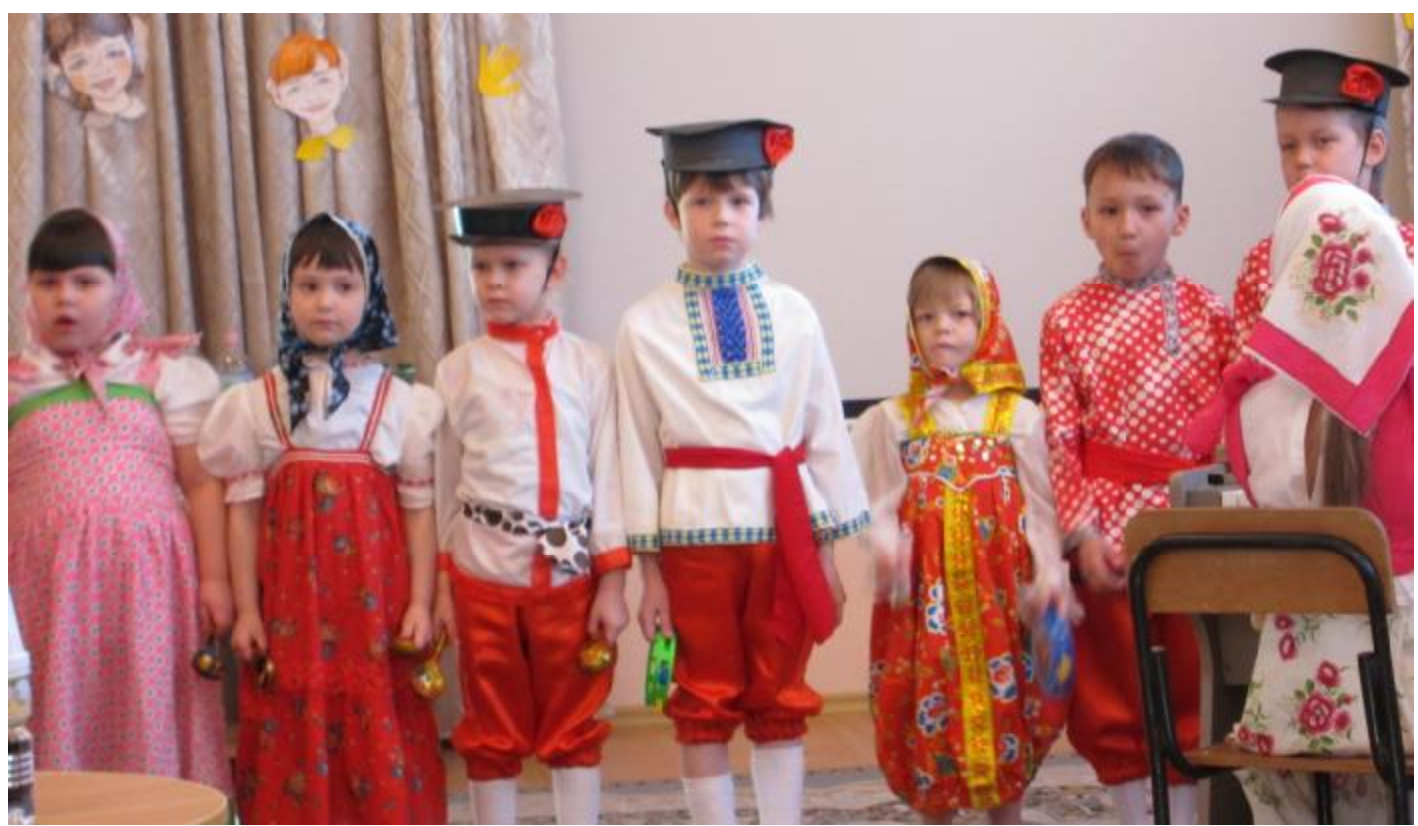
Kids in native costumes at the Seminar

Mary Mother of God Mission Society Vladivostok Russia Modesto California Issue Number One Hundred Eleven May 1, 2013