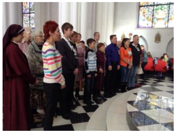
Renewing their baptismal promises with their sponsors

November 10. Nine adult parishioners were confirmed, including several much older folks who had been baptized as children in Belorus, but never confirmed. It was surely a happy day for all of them. There was tea and coffee afterward so that the bishop could get more acquainted with them.