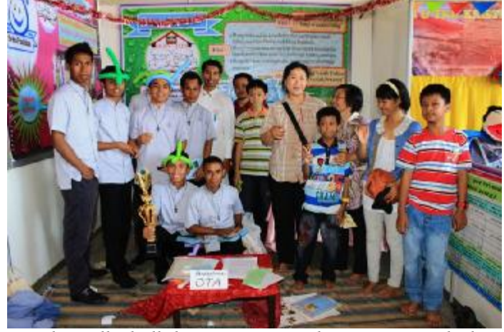
Besides volleyball the seminarians play soccer regularly with the neighborhood kids—Those are their fans!

• St Yohanes Marinus Parish in Surabaya, Indonesia, where our seminarians attend and help at mass, celebrated its 17<sup>th</sup> birthday this year. There was a youth volleyball tournament , and our seminarians were determined to win. Here they are with the trophy and happy fans!