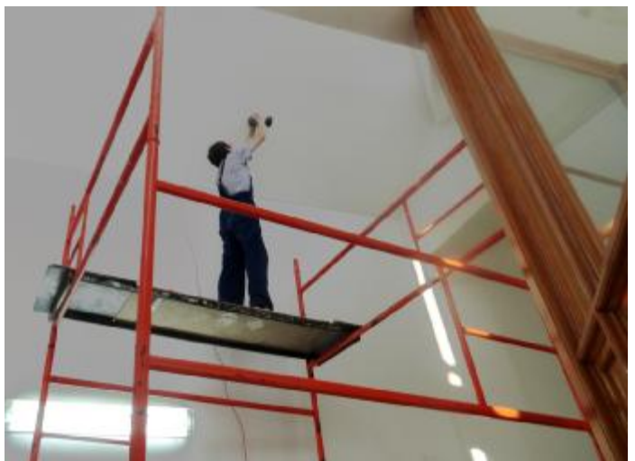
Installing the fire detectors in the monastery