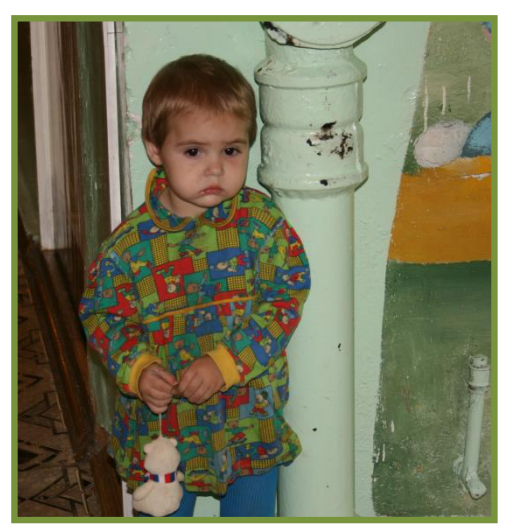
Your support helps feed and cloth children living in the orphanages.

Our mission international cookbook, Abundant Blessings, has been well received! We're getting great feedback! "It's beautiful!", "I love it!", "Well put together.", and, "I'm getting several to give as gifts." are common responses. A great WEDDING or MOTHER'S or FATHER'S DAY gift! The cookbook has nearly 500 international recipes and color photos of our mission families and a whole lot more. Check out more on