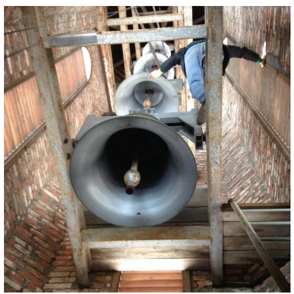
The bells as they hang now.