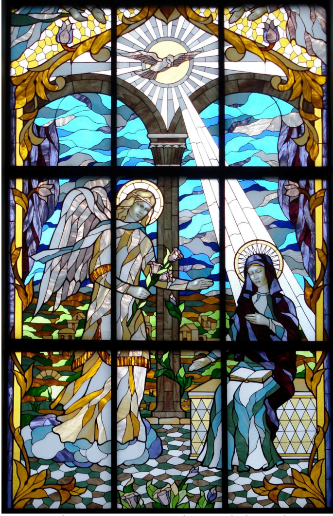
The Annunciation window in Vladivostok