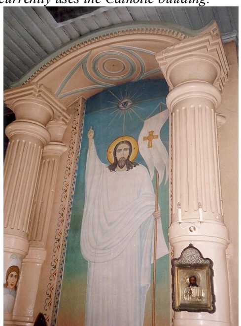
Image of Christ behind the altar where the Orthodox parish currently uses the Catholic building.