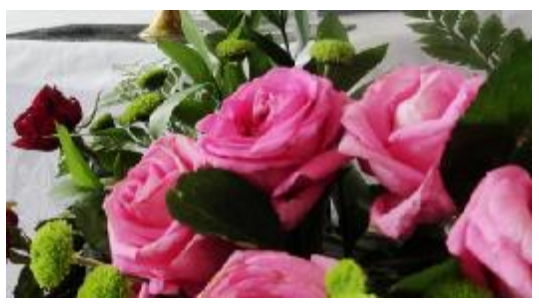
Month of May: Month of Mary!