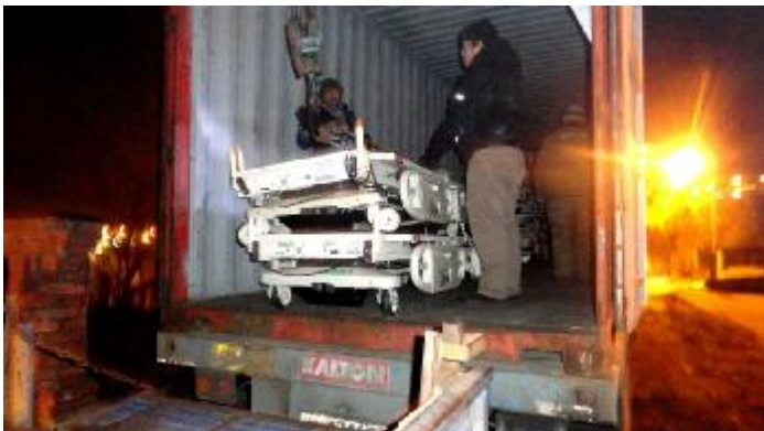
We had a crane to remove the heavy beds from the semi.