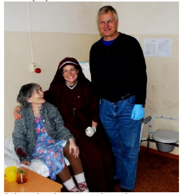
Such a comfort to have caring people around.

We learned a lot on or trip to Russia but the biggest thing we took away was that knowledge about the word of God is desperately needed. It is not the Russian peoples' fault that they don't know the word of God. The communists did such a complete job of killing or imprisoning anyone who had anything to do with religion. In many ways without God a society becomes dysfunctional. The selfless work the religious and other members of the Mary Mother of God mission is critical to the people of their area. Our new family has a special place in our hearts and we will continue to pray for all of them and support them in any way we can.