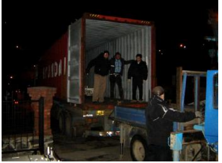
The novices really worked as a team to get the job done.