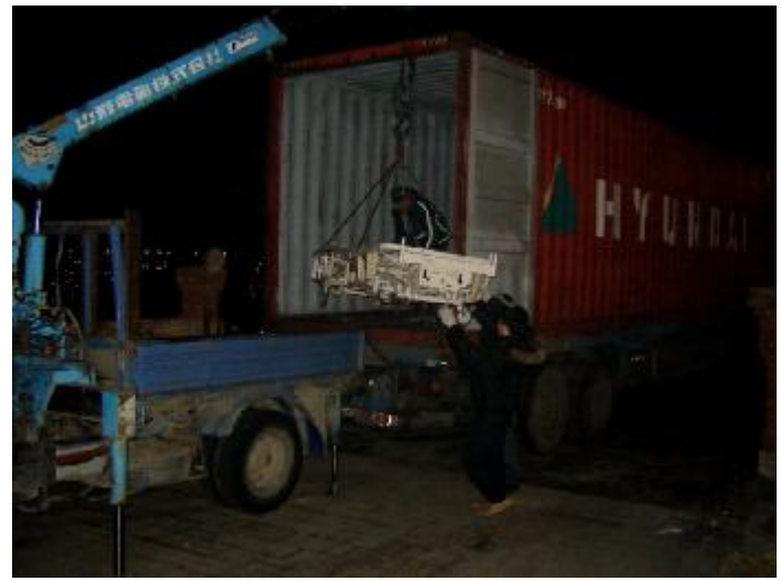
Even with a crane, it was a tough job.