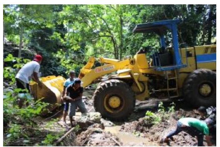
The bulldozer making a road to our land.