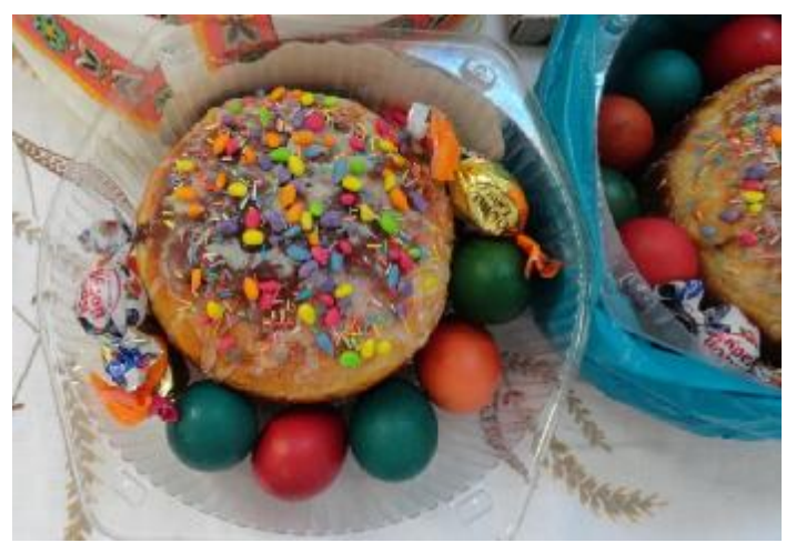
Traditional Easter End-of-Fast foods to be blessed at the Easter Vigil