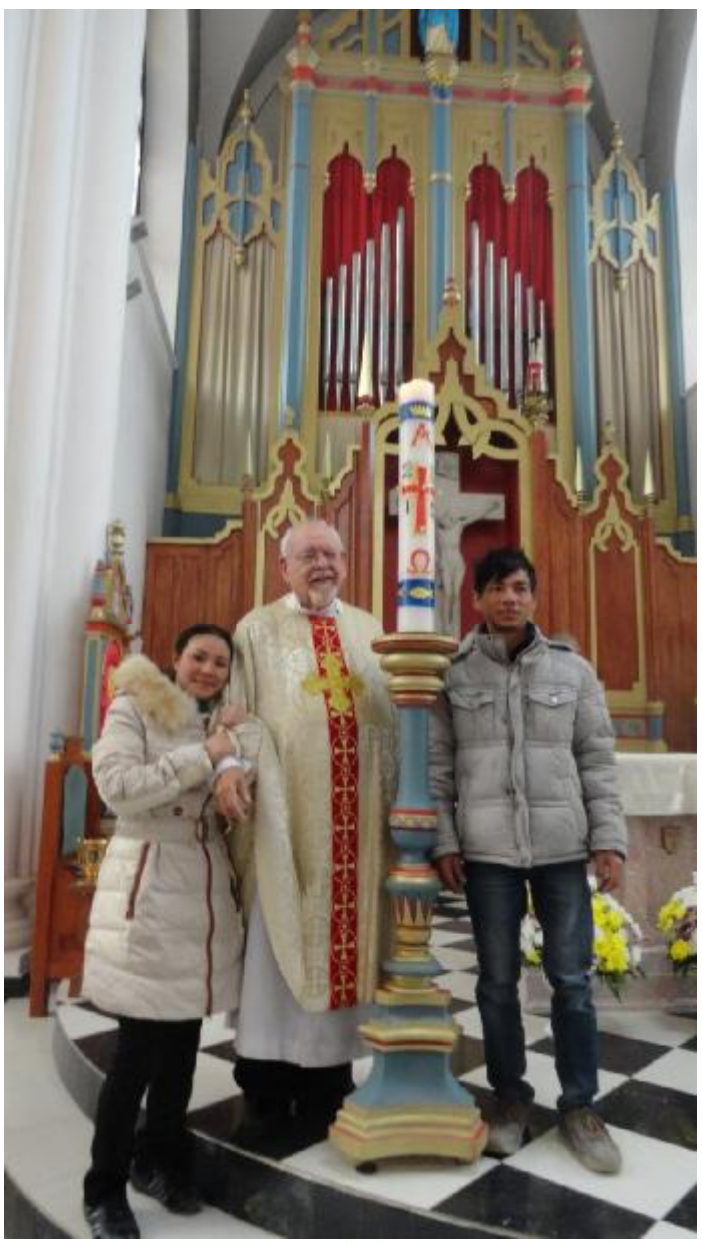
Vietnamese parishioners with the 2015 Easter candle.

Office in California: Phone: +1-209 408-0728 Mary Mother of God Mission Society 1736 Milestone Cir Modesto CA 95357 usoffice@vladmission.org