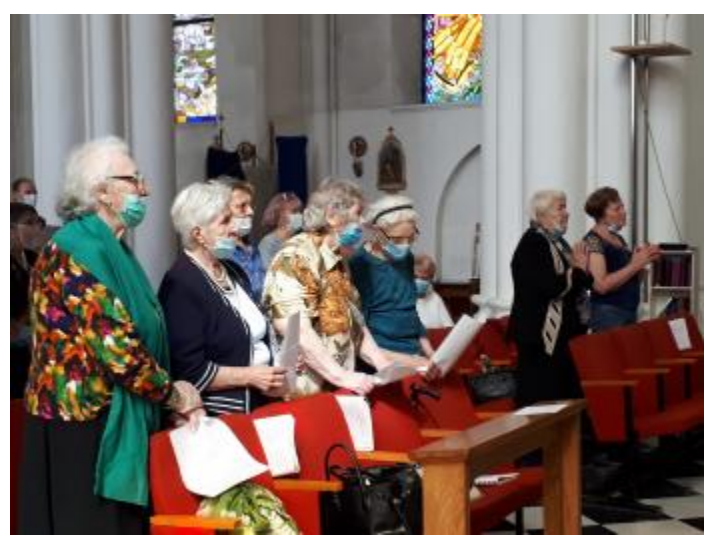
Some of the elderly waiting for anointing

• Our parishes began preparing for winter with our Sacrament of Anointing for the elderly and for those with chronic illnesses on October 4, and the Day of Thanksgiving for the Harvest on October 11. During bad weather many of our elderly will not be able to come to church—They don't have cars and the city is big, taxis are expensive, and buses required standing in the cold and waiting. We plan to continue uploading our Sunday Mass on the internet, but many elderly don't have internet access. So the annual anointing is something they really look forward to. Because of the Corona virus we took special care to keep distances and disinfect our hands. At 79 years old, I was also anointed. About 26 people took advantage of the opportunity. At the same Sunday Mass we also give an annual special blessing to parishioners who are doctors, nurses, social workers, and those caring sick people at home, asking the Lord to accompany them and give relief to those who are suffering. It also gives the parishioners a chance to see just who our medical people are.