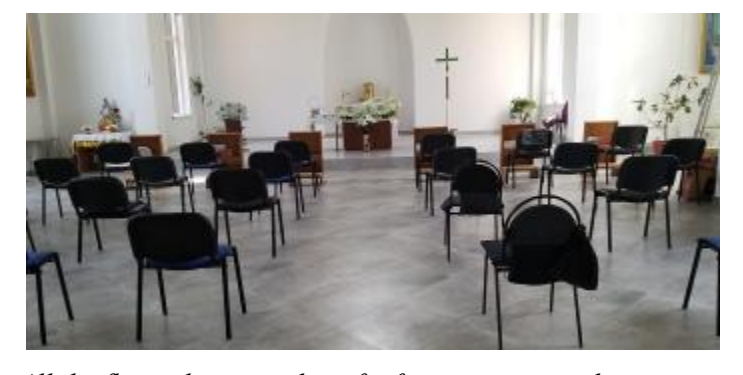
All the floor tiling was the gift of an anonymous donor. • The Nakhodka church of Our Lady of the Pacific is gradually taking shape with the completion of the floor and stairways. Next the permanent altar is being made, and the first set of stained glass windows are in process.