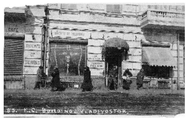
The Knights of Columbus café on Svetlanskaya St (main street.) in Vladivostok, looking nearly the same as today

• Our parishes began preparing for winter with our Sacrament of Anointing for the elderly and for those with chronic illnesses on October 4, and the Day of Thanksgiving for the Harvest on October 11. During bad weather many of our elderly will not be able to come to church—They don't have cars and the city is big, taxis are expensive, and buses required standing in the cold and waiting. We plan to continue uploading our Sunday Mass on the internet, but many elderly don't have internet access. So the annual anointing is something they really look forward to. Because of the Corona virus we took special care to keep distances and disinfect our hands. At 79 years old, I was also anointed. About 26 people took advantage of the opportunity. At the same Sunday Mass we also give an annual special blessing to parishioners who are doctors, nurses, social workers, and those caring sick people at home, asking the Lord to accompany them and give relief to those who are suffering. It also gives the parishioners a chance to see just who our medical people are.