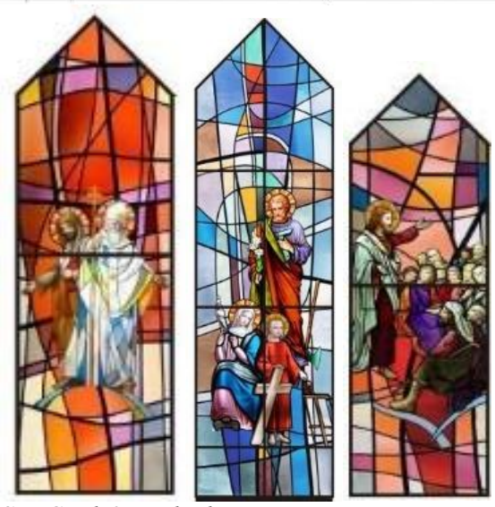
Sts. Cyril & Methodius Holy Family Sermon on the Mount