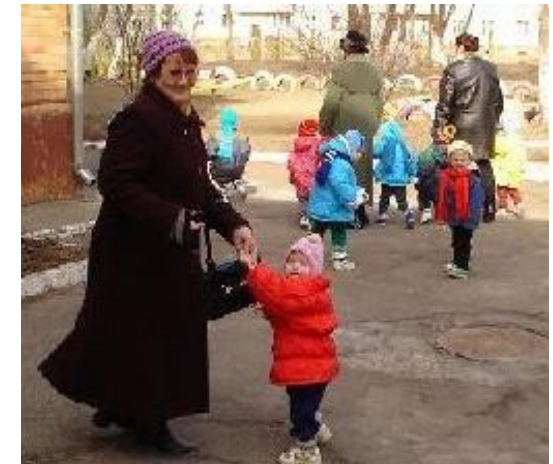
Some of the first Grandmas in Artyom.

For more on the Grandma Mentoring Program see our website or contact us at: