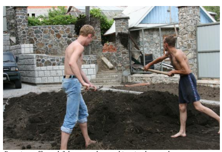
Burning off youthful energy by working in the garden.

A day at the ocean and a picnic is always popular.