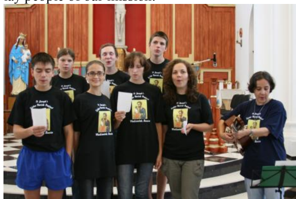
One of the small groups singing their conclusions.

time to talk to the priests, sisters, and dedicated lay people of our mission.