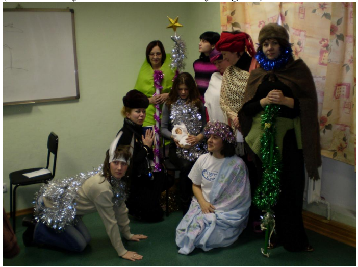
The Christmas "Play-Prayer"