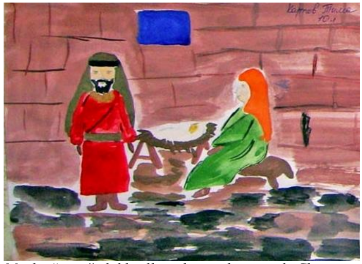
Maybe "your" child will send you a homemade Christmas card if you are his or her "guardian angel"?

♥ Would you like to be a guardian angel? "Project Guardian Angel" is the name we are giving to a program to provide assistance for children who were saved from abortion at our Women's Support Centers, but whose moms (and sometimes dads) now have trouble supporting them. Or for children of such poor families that they are in danger of being given up to the orphanage. Each case is written up with photos and concrete information about why and what is needed. You can "adopt" such a child by making a regular donation to help him or her. We'll send you information and a photo of the child and news about what is happening with the child. After your "adoption" you can send the regular donation by check or website-Just make the note "Guardian Angel" and we'll know to whom to give the aid. (And your prayers for "your" child would be appreciated, too.) If you have a monthly dollar amount in mind or some particular request, please send me this information by email or through our office, and I'll match you up with a child in need. Christmas and birthday presents for "your child" are welcome, too!