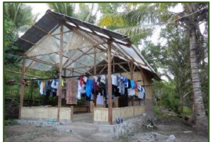
The 10 KW generator is housed in this out building.