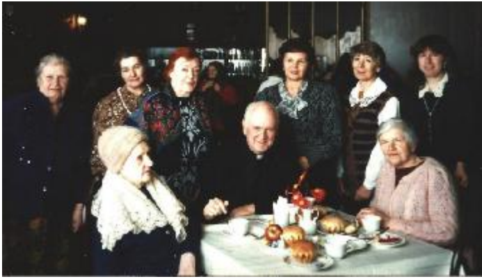
Archbishop Hurley in 1996 surrounded by our elderly parishioners