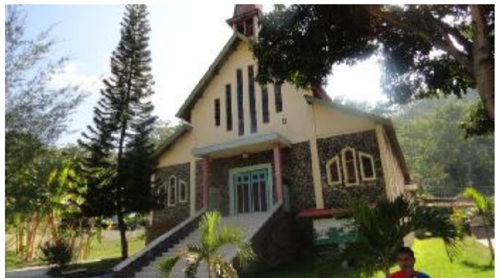
Sacred Heart Church in Wolowaru, site of the First Mass