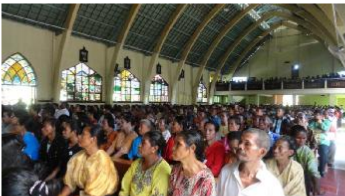
The Cathedral was packed—even the choir loft.