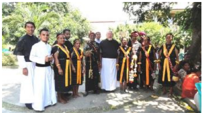
Many groups of native dancers came to the celebration.