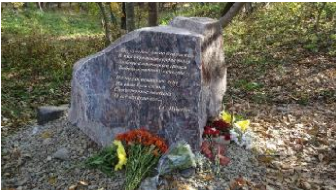
The front of the monument has words from a poem by Pushkin, whose relative is buried somewhere in the cemetery.

● On October 20 th a new monument was dedicated in Vladivostok's Pokrovsky Park to remind people that the Park was earlier the main city cemetery. The religious preference of citizens of the city before the revolution is shown by the fact that the Pokrovsky Cemetery had equal space for Orthodox, Catholics, and Lutherans, in that order, and then there were the Jewish, Moslem, and other smaller sections. The Cemetery was called "Pokrovsky" because of the Orthodox church that was located in it, The