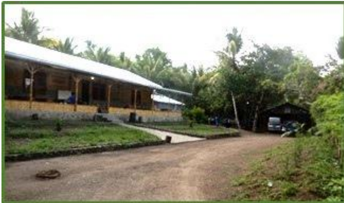
The temporary living quarters serves as the foundation for the permanent building and classrooms. 8

Immediate housing was necessary to accommodate the many vocations. The rectangle building that ( Cont. pg 7 )