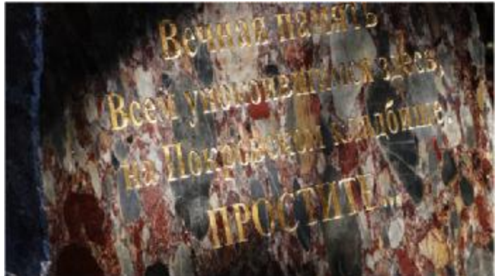
"Eternal memory to all who are resting here in the Pokrovsky Cemetery. Forgive us!"