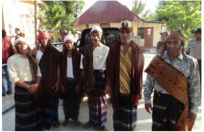
The Pati Tribal elders were there to greet us.