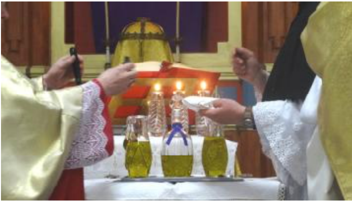
The Holy Oils being blessed by Bishop Kirill. They are basically olive oil, but chrism has balsam added to it.