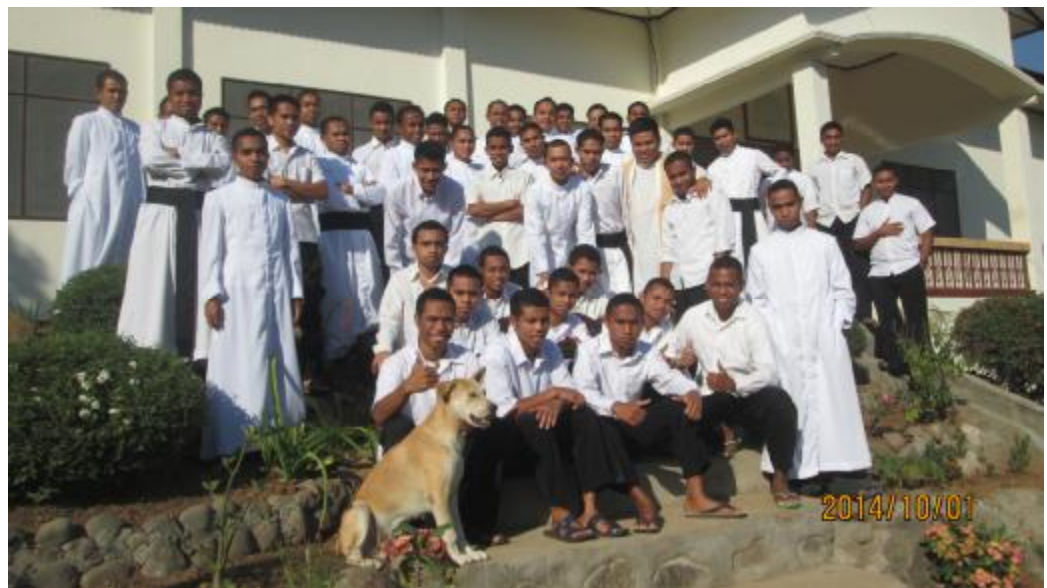
Seminarians from the Vocationists' seminary in Maumere, Indonesia, who came to see me off. Four of our seminarians live and study with them.

More good news is that the Franciscan Mission Warehouse in Kansas City has shipped to us 41 used electric hospital beds! We had to buy new mattresses to ship with them, and we have to pay for transportation and customs expenses. It is a wonderful opportunity, so we can't pass it up. We are looking for funding for our part of the expenses. Most of the beds will go to the Hospice in Vladivostok, and the rest to the general city hospital in Lesozavodsk where our Women's Support Center has been located many years already. They also don't have proper hospital beds either! Both places have only flat beds currently, so you can imagine how difficult it is for sick elderly folks to eat the usual Russian soup without getting it in their lungs. That is a cause of dangerous lung