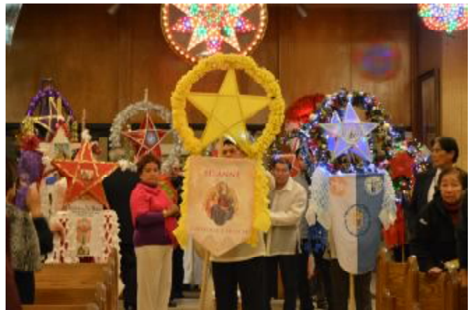
Plenty of stars for Christmas in Las Vegas

joining us, and we encouraged them to bring their own processional "Parol" lantern to symbolize their own prayer group. Hearing Christmas carols and Mass songs in the Tagalog language was nostalgic to most of them. That adds to the joy and festivity of the Simbang Gabi. Each prayer group was assigned to prepare for a particular night with choir, readers, ministers and food after the mass. Nightly almost 250 people attended, but the biggest one was on December 22 when the Diocesan Pilgrim Simbang Gabi visited at St Ann's Parish and so we hosted about 500 people."