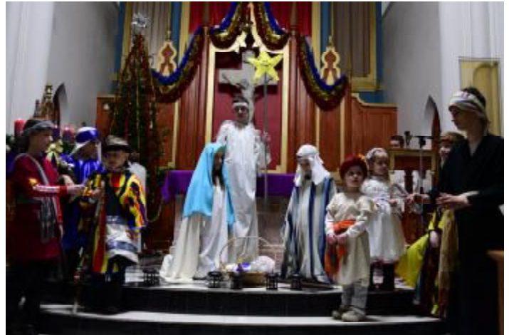
Unto us a child is born! In Vladivostok