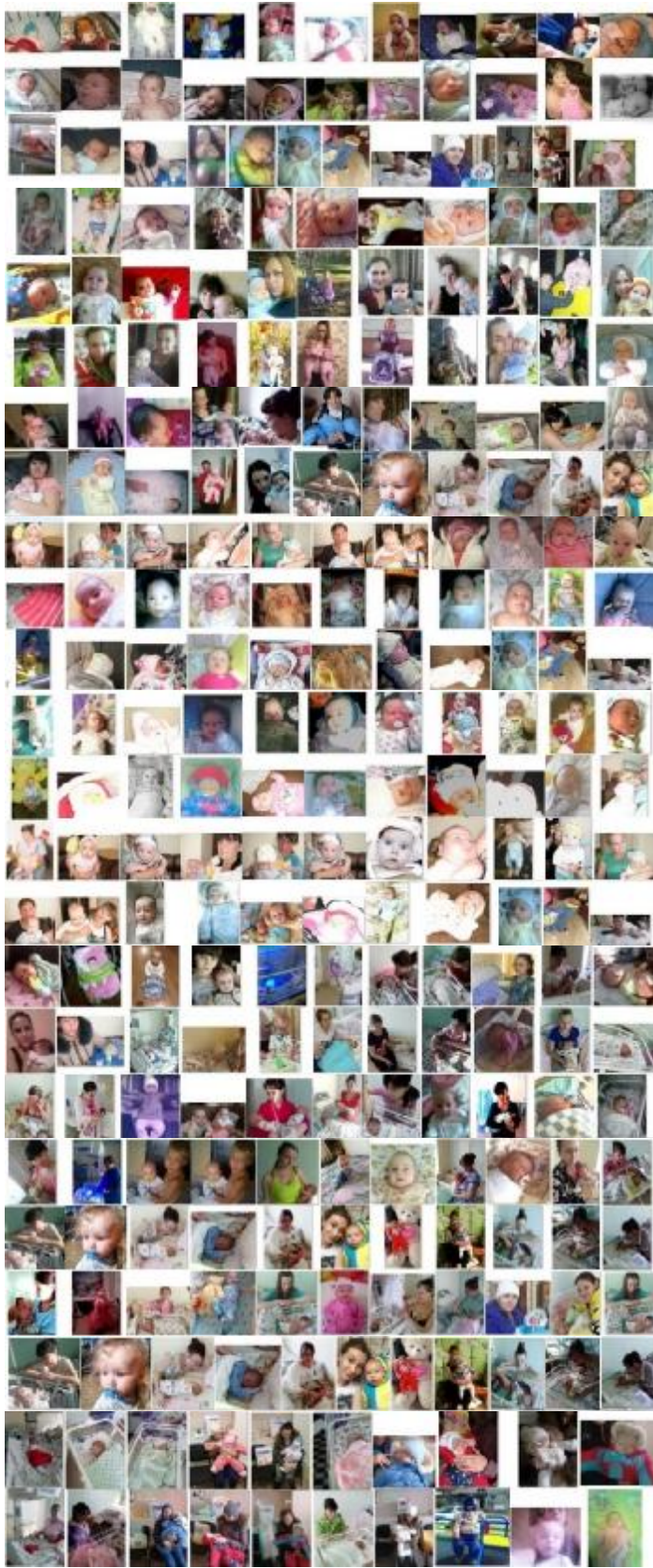
Here they are—All the kids and moms saved or helped in 2017 by our six Women's Support Centers. Thanks, Benefactors!