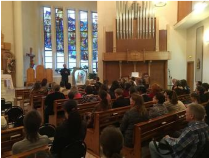
First Concert February 2, 2018