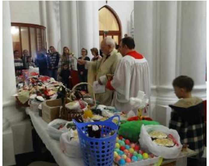
Blessing of Easter foods to break the Lenten fast.