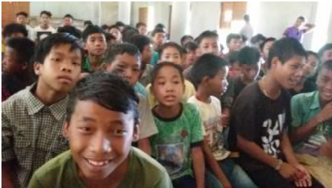
Retreat day for children in North East India