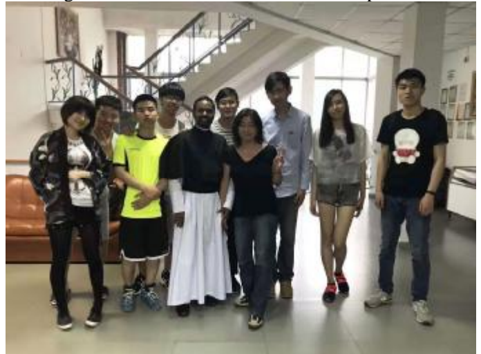
Working with Chinese students at the federal university in Vladivostok

which opens up new horizons, new mission, and a plan of action. In the words of St Paul, let us run with endurance the race that is set before us, looking unto Jesus, the author and finisher of our faith (Hebrew 12:1-2). Looking unto Jesus gives purpose in life. A sense of confidence to face the challenges that are ahead. The challenges remain no more a threat but a scope of action.