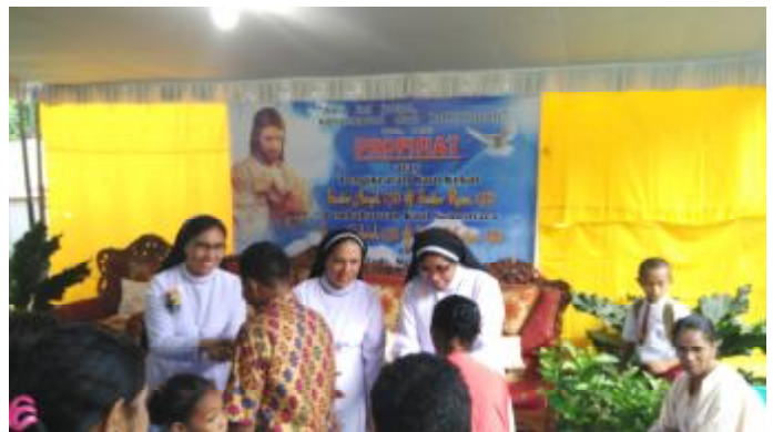
Sisters in reception line. Indonesian dancers