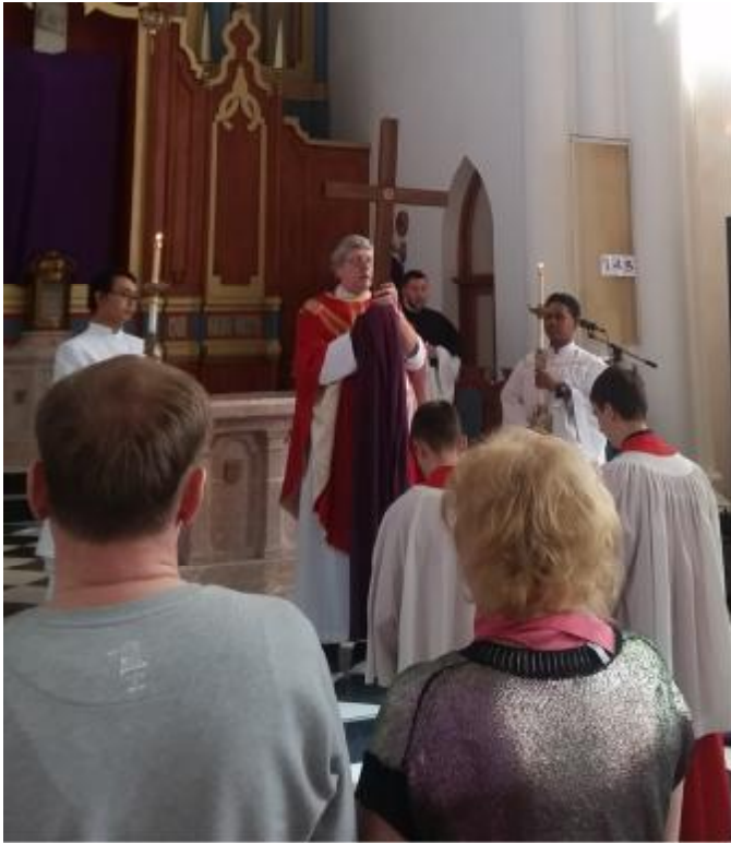
Good Friday greeting of the relic of the True Cross which we received years ago from the Mission Office in St Paul, Minnesota