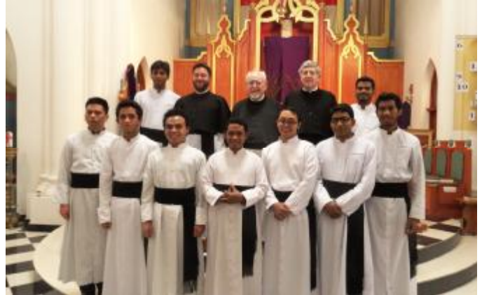
Nine novices with us three of the Vladivostok community