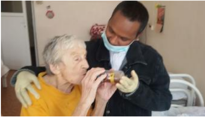
Working with the dying at the Hospice