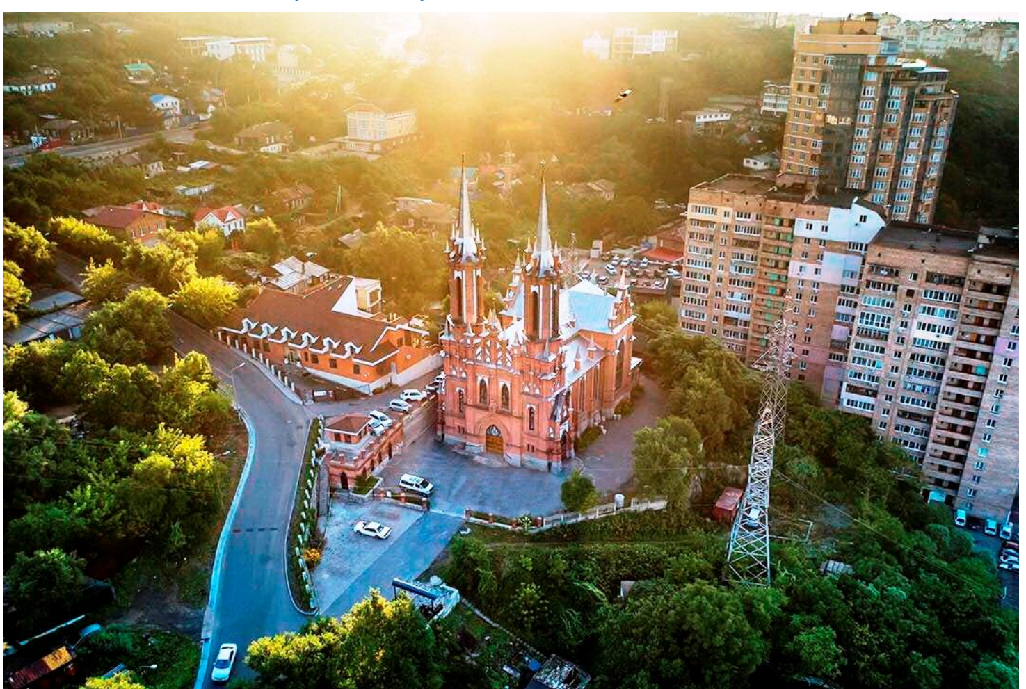
Our Church of the Most Holy Mother of God in Vladivostok as seen from a drone

Issue Number One Hundred Forty Five January, 2019