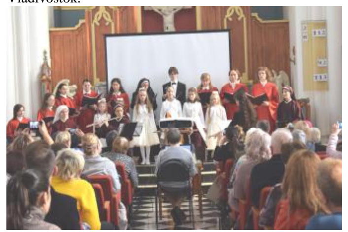
Children from Romanovka express their appreciation for the sisters' work with children in Romanovka

In the first several decades of their existence the sisters expanded to many hospitals and started homes and schools for abandoned children throughout Spain. In 1890, with the vision and direction of the dynamic superior general, Mother Pabla Bescos, the congregation opened its first missionary community outside of Spain at an isolated leper colony on the Venezuelan island of Providence. Communities on other continents followed: Asia 1951 (India); Africa 1970 (Ghana); Australia (1985); and in Papua New Guinea (1992), Philippines (1996) and the latest one in Kosovo (1999). Now there are more than 2000 sisters in 37 countries on 5 continents and in Oceania. The local community in Vladivostok belongs to the vice-province of St. Francis Xavier with headquarters and several communities in the Philippines and with other communities in China, Papua New Guinea, Australia and Russia - the one community in Vladivostok.