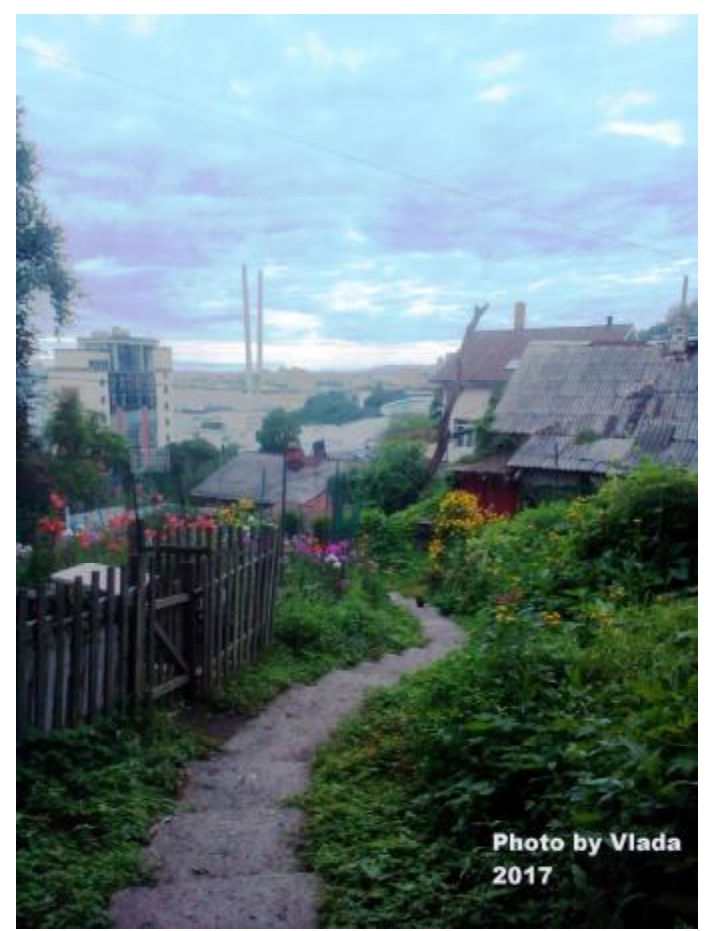
The path to our church