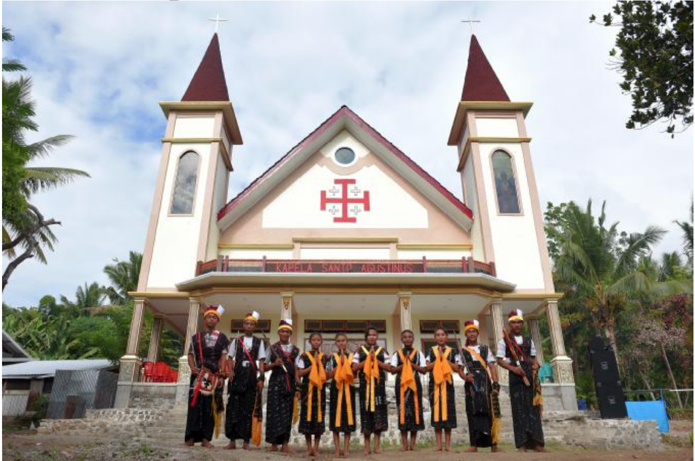
Youth in native costumes standing before the new St Augustine Chapel in Maumere, Indonesia