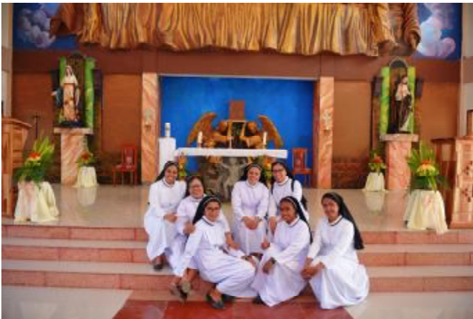
Seven of our C.J.D. Sisters in Jesus the Lord from Indonesia attended the event.

Inside the chapel, the sanctuary is dominated by a large bas-relief “Last Supper”, which reflects the opening lines of the Rule of St Augustine: “The reason you have come together is to live in unity in the house with one heart and one mind in God.” It was made with joy by a local artist whose name, unfortunately I didn’t get. Above the Supper is the crucifix, and below it is the tabernacle supported by cherubim.