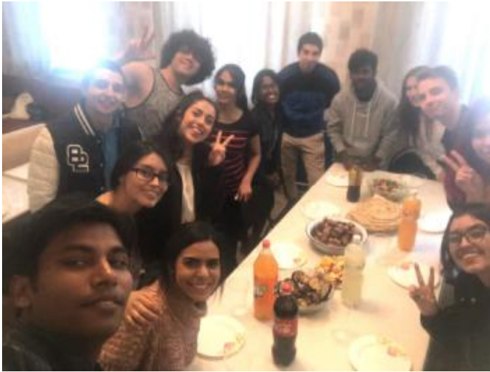
Barbecue is always popular with the University students, who are, of course, always hungry!