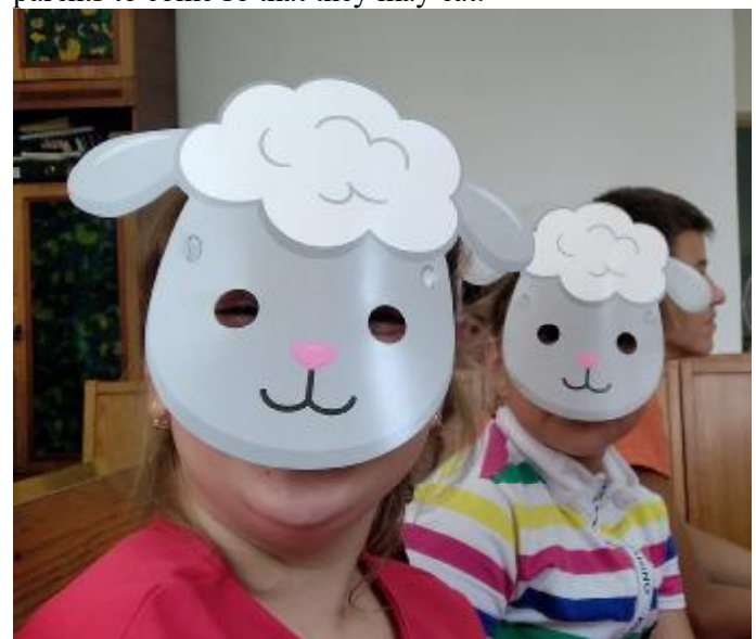
Some little sheep needing a good shepherd

daily wages and hardly manage their expenses. Their children go for school every day in the school year but after school they are just roaming here and there. There were some children who are smoking in very young age and there was nobody to stop them. There is nobody to take care of them after school. They just wait for their parents to come so that they may eat.