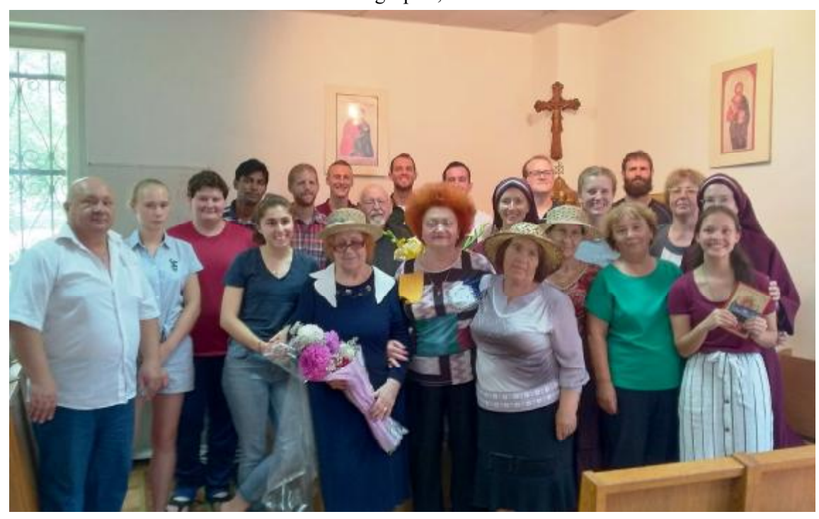
Volunteers and Lesozavodsk parishioners

Frankly, it was my one of the best experiences I've had working with children. I enjoyed being with them in their happiness and joyful moments. As they were learning through us, I also learn some skills by working with them. On the other hand, to be with children is to have patience--Sometimes children don't listen and do whatever they want. I learned that instead of being frustrated it is better to listen them first and then make decisions.