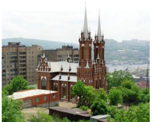
The Cathedral of the Most Holy Mother of God in Vladivostok

Surely it was one of the largest dioceses in land area in the history of the world. Our church was the cathedral of the diocese.