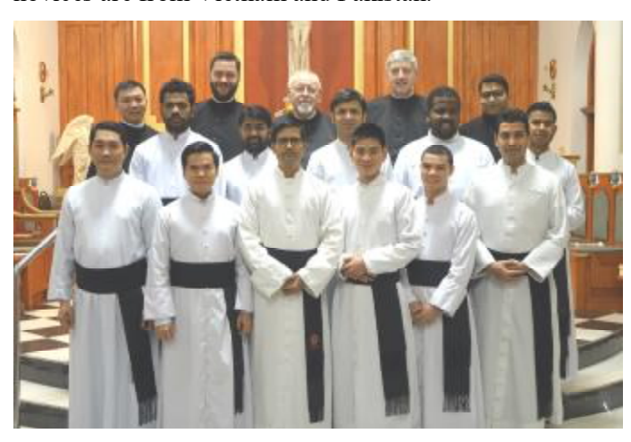
Christmas scene in our monastery, 2019