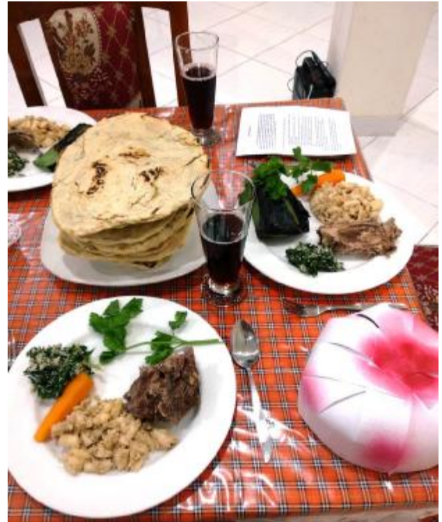
Seder foods prepared for the Seder meal.